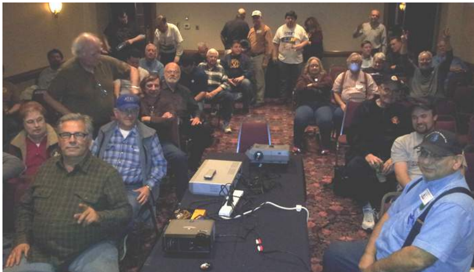
Below: Group shot of 10th Dallas Area Media Slide Show.