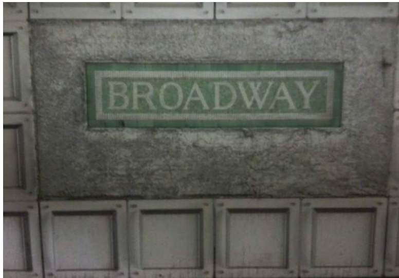
Above: The Broadway Station.

This mosaic sign is similar to those in New York City subway stations. This station had old pictures and advertisements of factories which were once in the area 100 or more years ago.