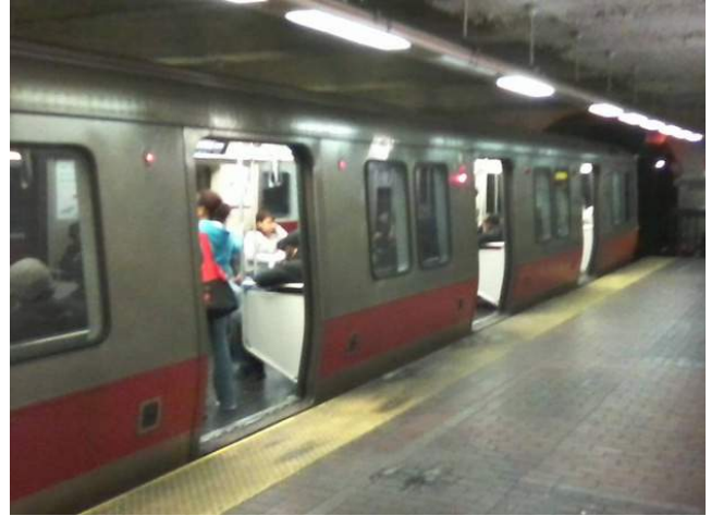
Above right: Red Line.