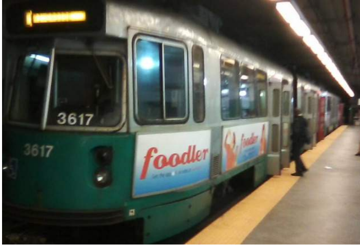
Above left: Green Line.

Last Fall I took a trip to Boston and rode the subway.