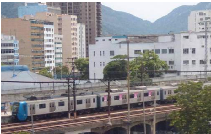
Above left: Commuter train in Rio De Janeiro, Brazil, 01/26/15.

My Fellow Ferroequinologists, I went on a 3 week trip to South America in late January and the first part of February. While I was not able to get nearly as many rail photos as I would have liked (which is not unusual for such a unique trip as this), I did manage to get a few. To get things started, here are four photos that I thought most interesting.