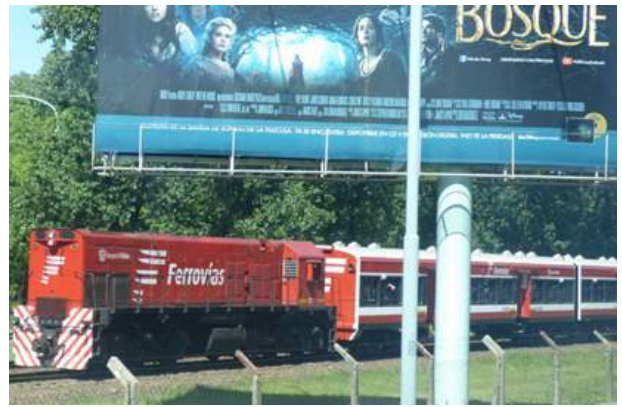
Above right: westbound commuter train on the outskirts of Buenos Aires, Argentina, 02/01/15