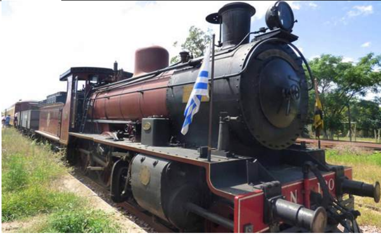
Above left: Juanico Wine Train powered by engine 120 (a 2-6-0, I think) at the Juanico Winery Station, about 22 miles north of Montevideo, Uruguay, 02/02/15.