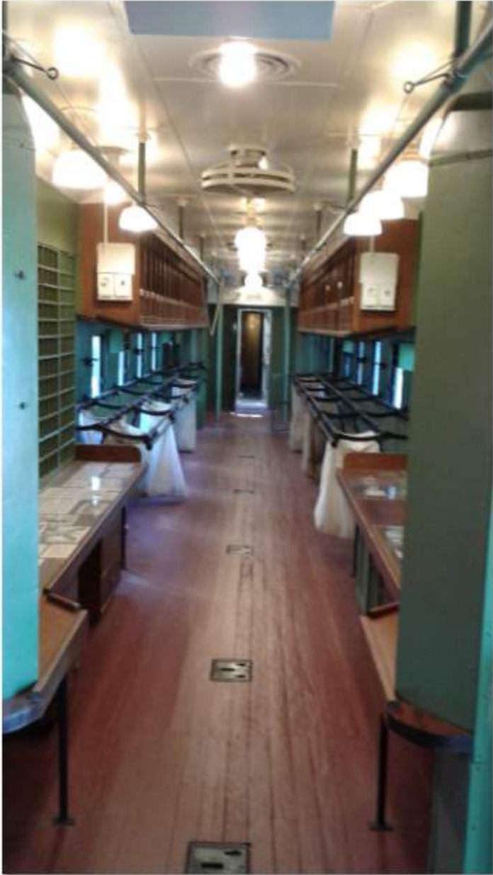
(Above left.) Interior of RPO Car, Galveston Railroad Museum.

http://www.galvestonrrmuseum.com/about-us.html . Last accessed May 17, 2017.