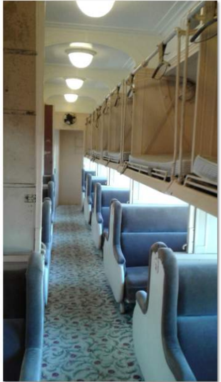
(Above right.) Interior of Pullman car with upper berths on right side down for night use, Galveston Railroad Museum.