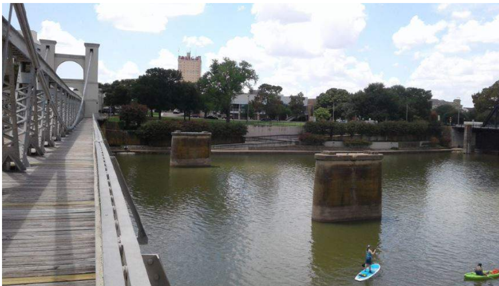
Above: Texas Electric Railroad bridge abutments and 1870 suspension bridge.