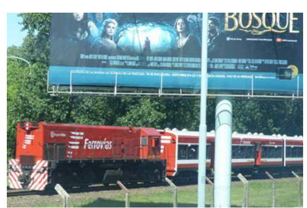
Above right: westbound commuter train on the outskirts of Buenos Aires, Argentina, 02/01/15