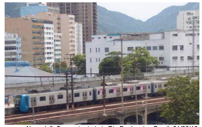
Above left: Commuter train in Rio De Janeiro, Brazil, 01/26/15.

My Fellow Ferroequinologists, I went on a 3 week trip to South America in late January and the first part of February. While I was not able to get nearly as many rail photos as I would have liked (which is not unusual for such a unique trip as this), I did manage to get a few. To get things started, here are four photos that I thought most interesting.