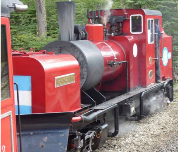
Above right: Tanker engine "Engineer H. R. Zubieta", on the Ferrocarril Austral Fueguino (Fuegian Southern Railways), in the Tierra Del Fuego 12 km (about 8 miles) from Ushuaia, Tierra Del Fuego. This is advertised as the "Southermost Railway in the World".