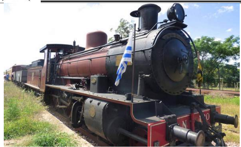
Above left: Juanico Wine Train powered by engine 120 (a 2-6-0, I think) at the Juanico Winery Station, about 22 miles north of Montevideo, Uruguay, 02/02/15.