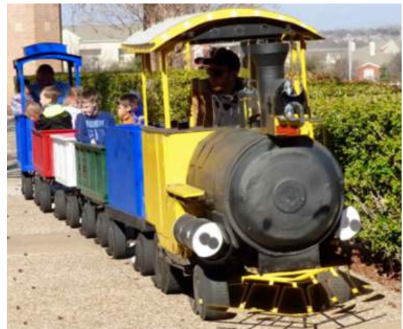
Above left and right: Skip and trackless trains at the Plano Train Show.