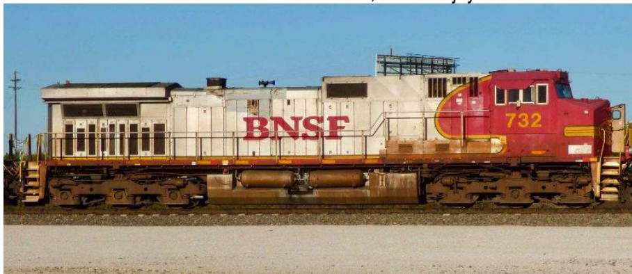
Right: BNSF 732, still in classic warbonnet colors.