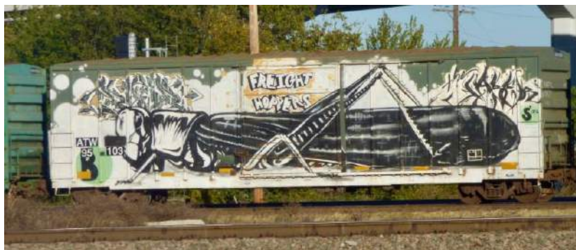
Left: "Freight Hopper". This must have taken days to complete. It also showcases a talented (but misguided) artist.