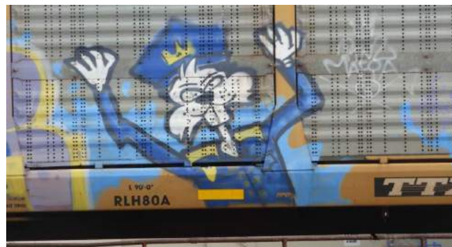
Right: A not too flattering depiction of a police officer. Graffiti artists do not like police officers.