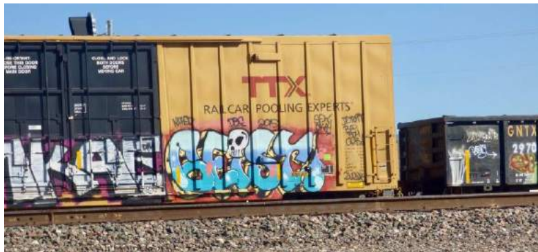
Left: Graffiti "GEIST" on a rail box car.