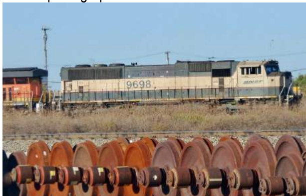
Left: BNSF 9698 leads a SB coal train. One does not see many green/cream colored units anymore, especially in lead.

Recent photographic adventures in Fort Worth. These were taken on November 18 and December 2, 2016. Enjoy!