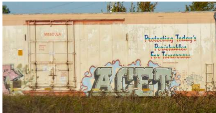
Right: "ACET" logo on a reefer.