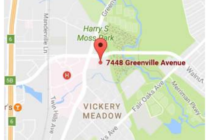
More information: http://www.sokoldallas.org/contact/