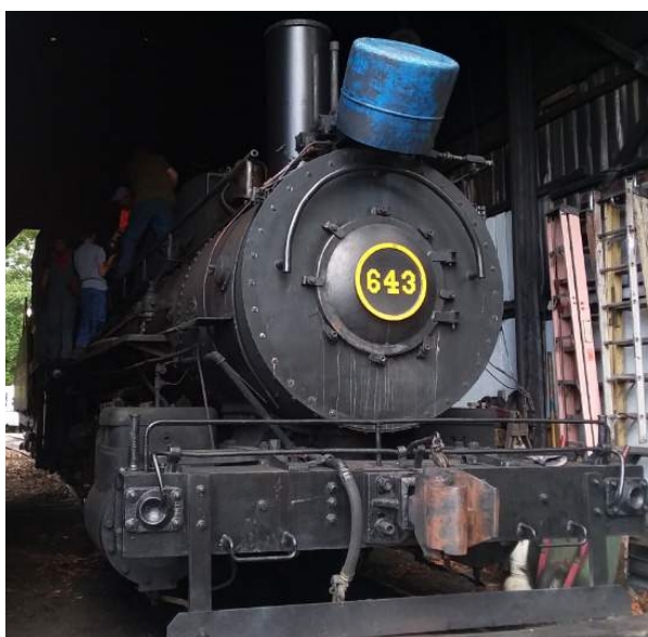
Right above: Looks like she's got her best face on!