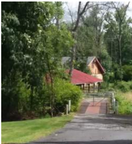
Left above: Glimpse of former amusement park