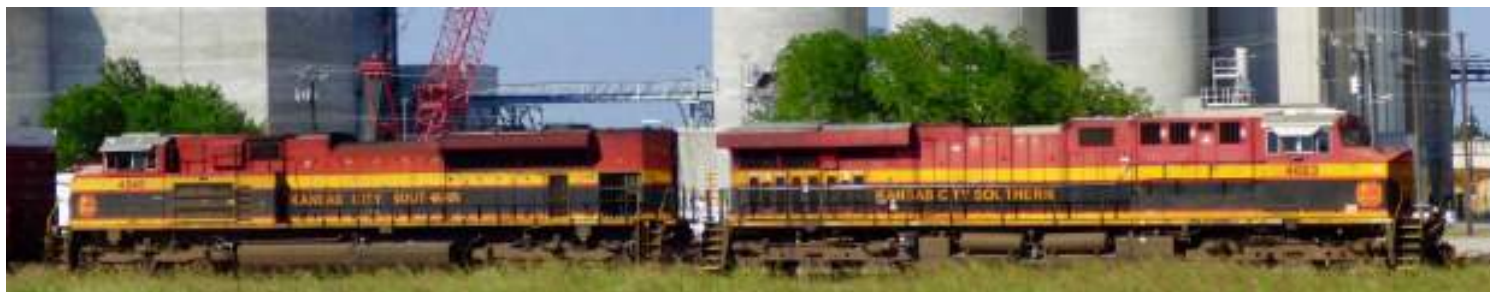
Above: Two KCS Southern Belles lead a southbound freight by the Saginaw depot. In my opinion, the Southern Belle paint scheme is one of the most pleasing contemporary paint schemes on the rails.