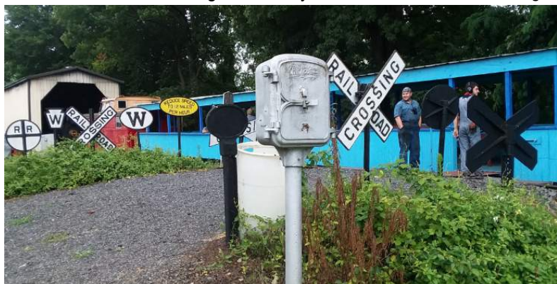
Left above: Loading up for the next trip.