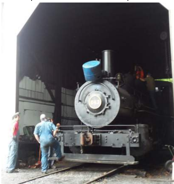
Left above: Will 643 go out today or won't she?