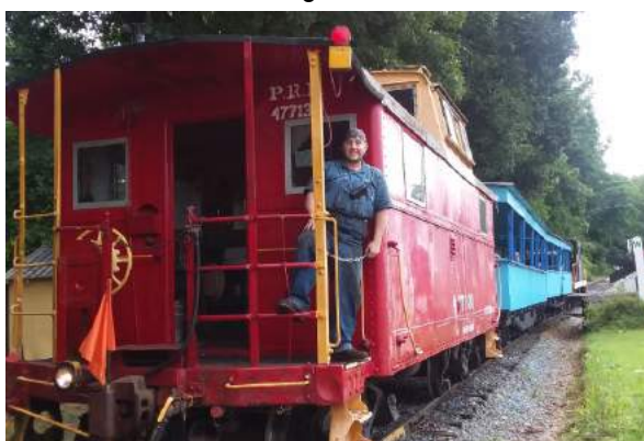
Right above: Here we are, back already!

Read more about the Williams Grove Steam Engine Historical Association – its history, steam equipment (not limited to rail) and operations at https://www.wghsea.org/ . Williams Grove is located about 15 miles north of Gettysburg PA.