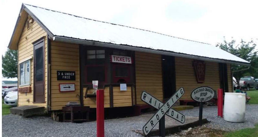
Right above: WGRR ticket office. Here be trains!