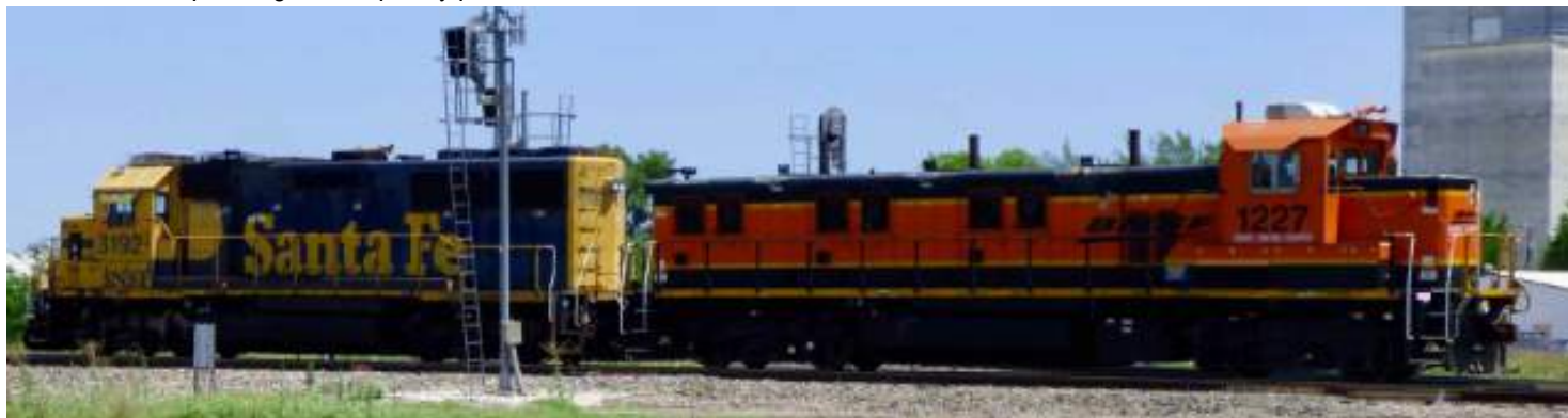
Above: BNSF 3192, a GP50 still in "Santa Fe" blue and yellow and genset 1227 amble by the depot on a light engine move.