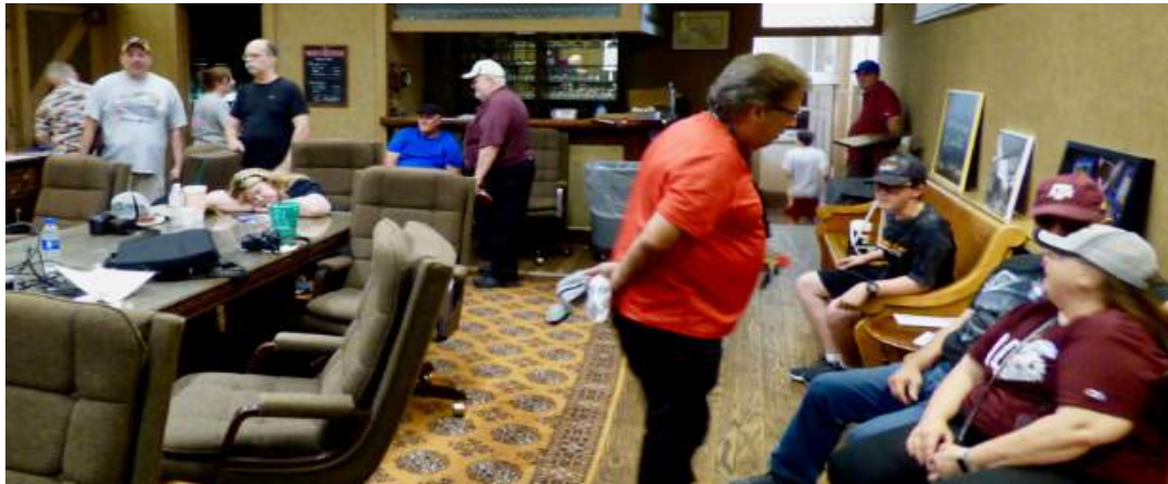
Left: The conference room - where video presenters showed their movies and slideshows, and attendees had an opportunity to participate in rail trivia games. Along the walls Wayne Smith had arranged items for the silent auction. The conference room also functioned as a cooling station for those seeking relief from the heat.