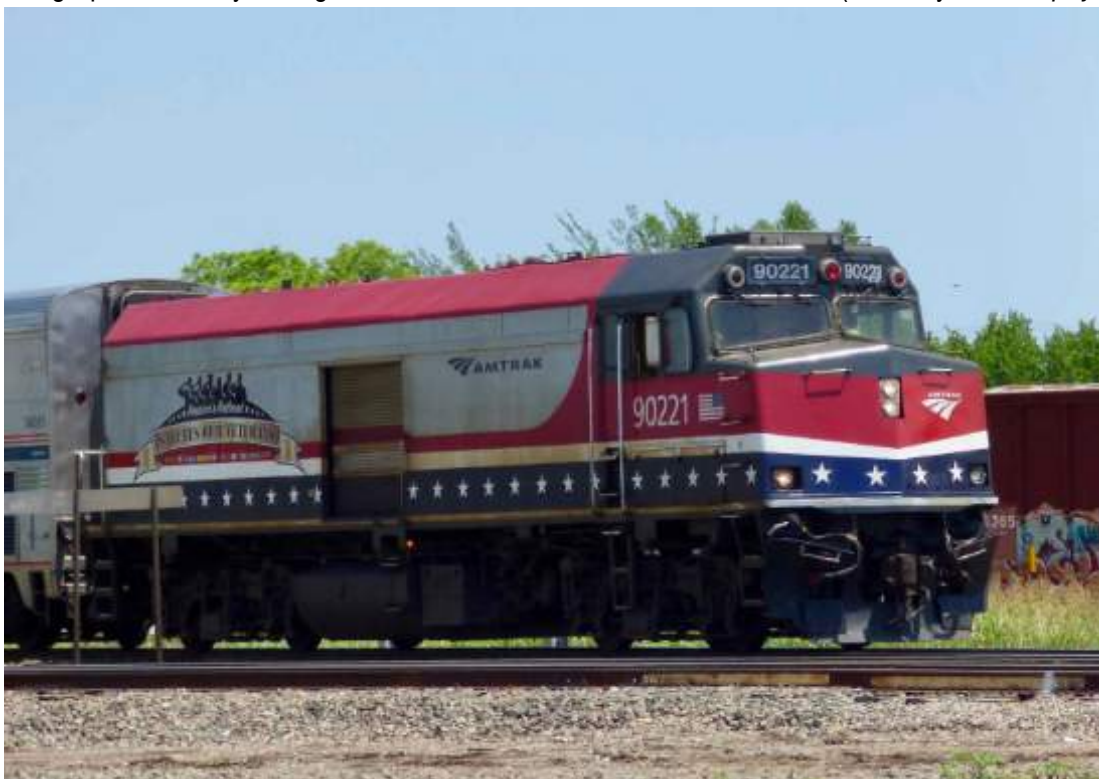
Above: Southbound Heartland Flyer passing early Saturday afternoon. This time the Veteran’s Unit cab car is in the lead.