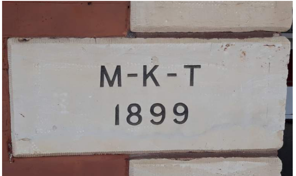
Right: Cornerstone of Belton KATY station. Belton, Texas