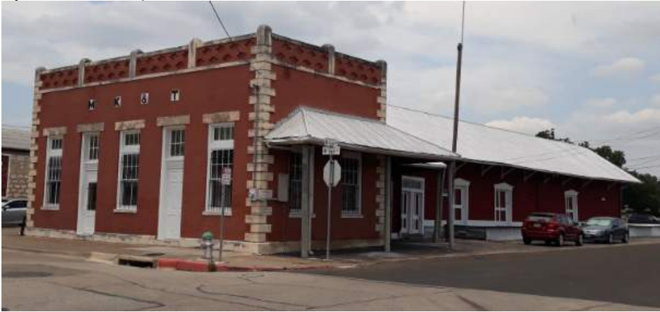
Left: KATY passenger and freight station. Belton, Texas.