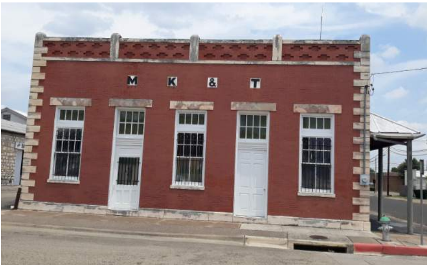
Left: KATY passenger station Belton, Texas.