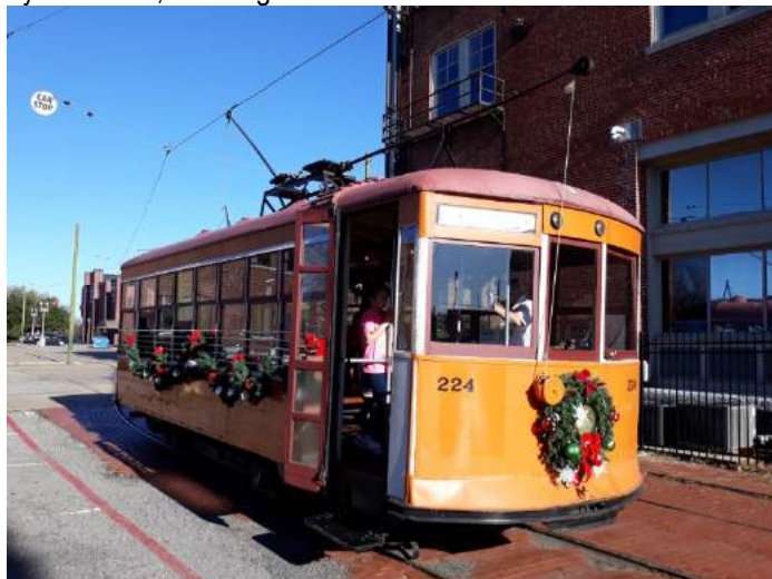
Left: Decorated for Christmas, November 30, 2019.