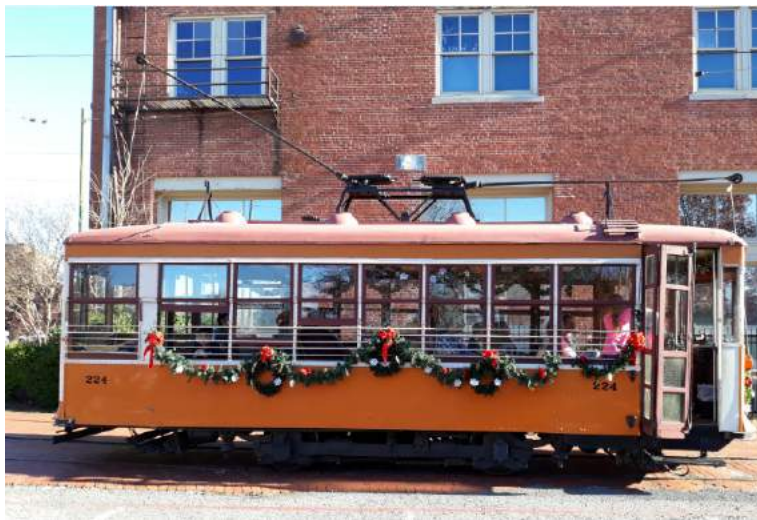
Right: Festively bedecked trolley is not a folly. November 30, 2019.