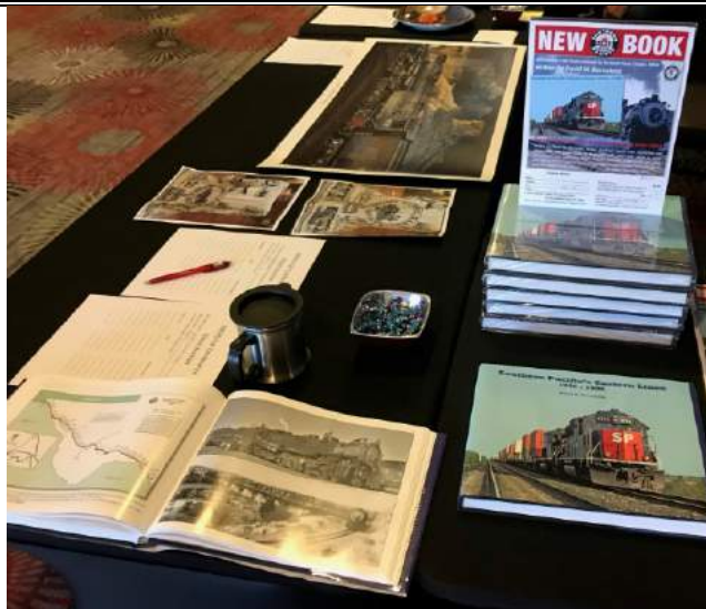
Right: Railroad history books and artwork provided colorful memories for visitors to buy and take home.