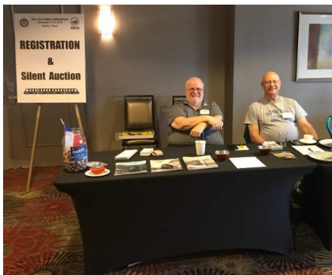
Left: A pair of friendly North Texas Chapter members welcome everyone to Dallas.