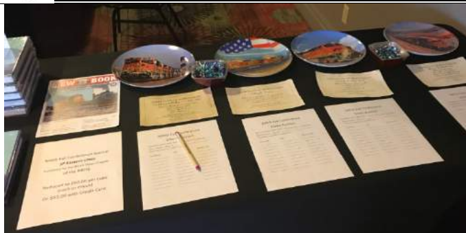
Above left: Enticing auction items attracted bidders.