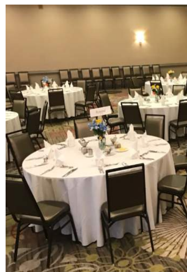
Right: Elegant banquet ambience ready for convention members.