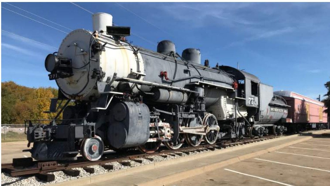
Above: Grapevine rails on display.