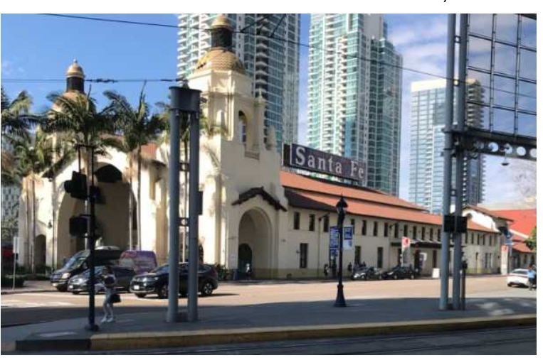
Above right: Depot is in Spanish Colonial Revival style.