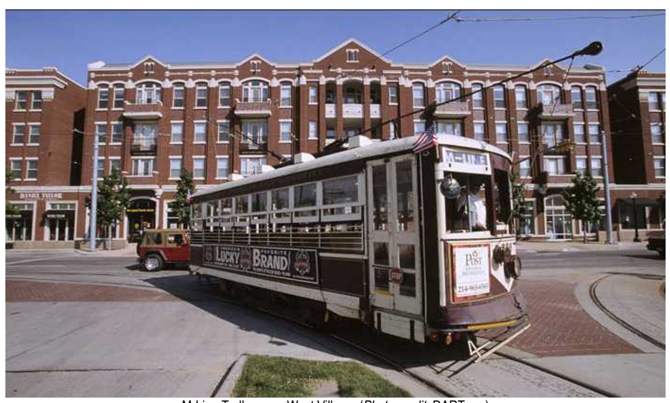
M-Line Trolley near West Village.