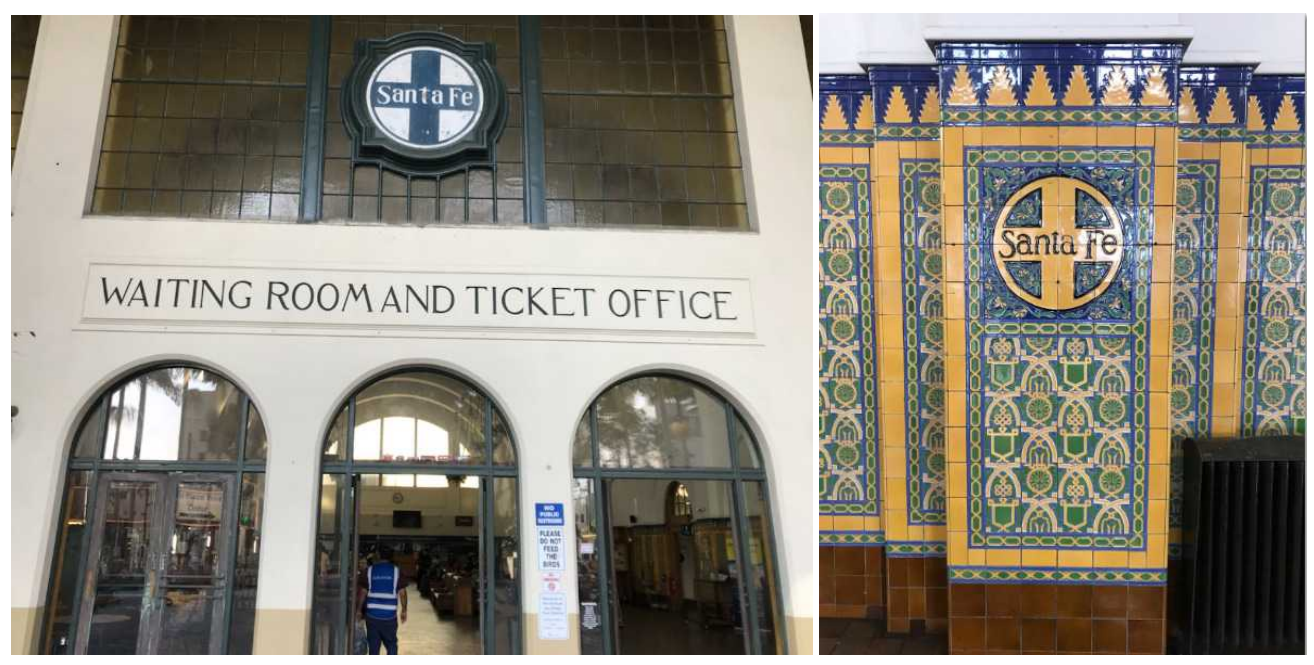
Above: Classic Spanish Colonial Revival design of the Santa Fe.