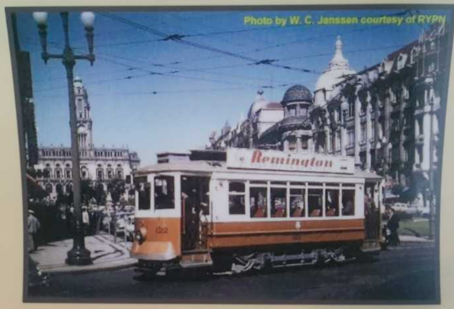
Built in 1909 - J.G. Brill Company