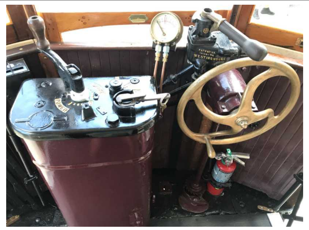
Above: Motorman's view.