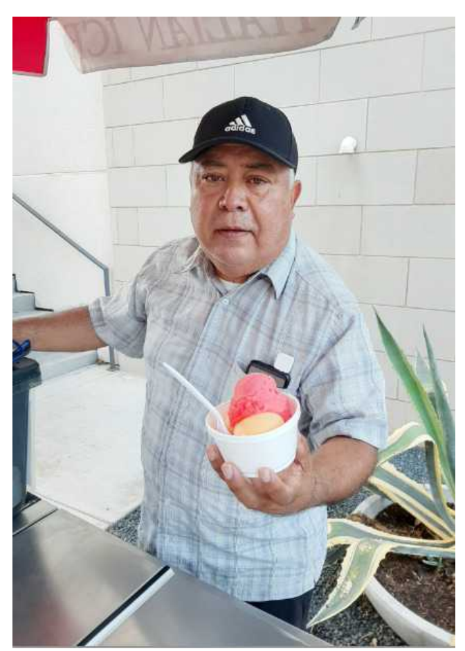
Above: This gracious gentleman shared free ice cream for the attendees. Skip had two servings.