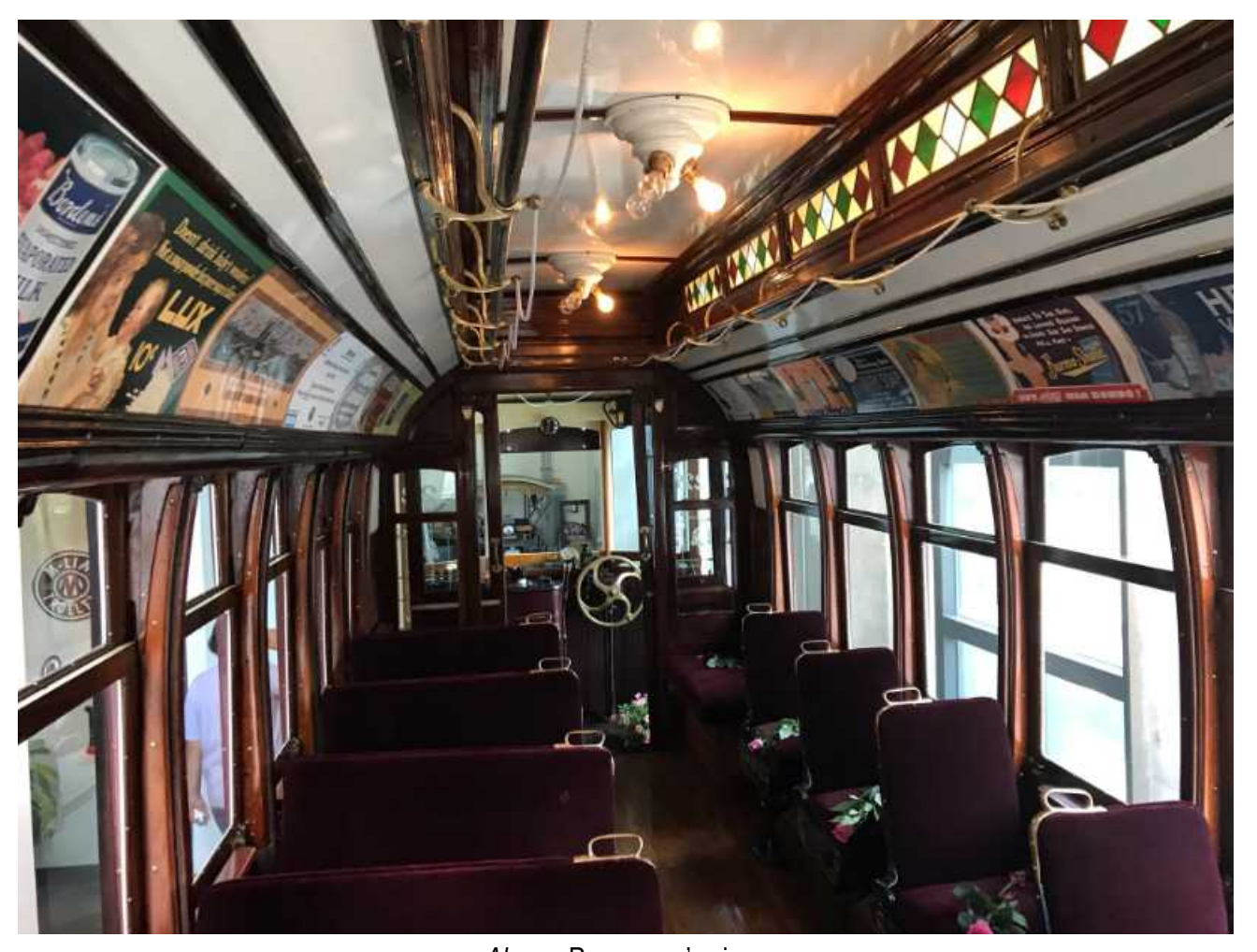
Above: Passenger's view.