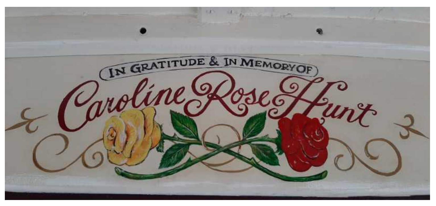
Above: "Rosie" was restored with funds from the Hunt Foundation, was named after "Rosie" Hunt.