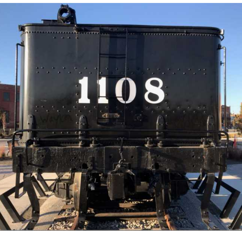
Locomotive No. 1108 actually sits near the Amtrak depot.