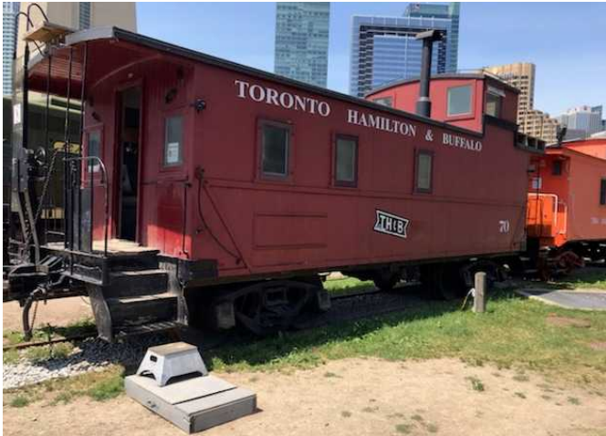
Above and below: Toronto Railway Museum and Roundhouse Park.