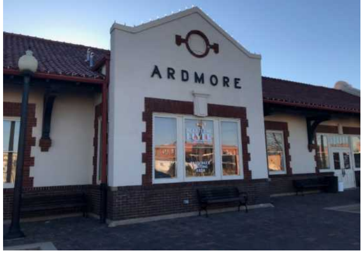
Most of it serves as a conference and event center now.