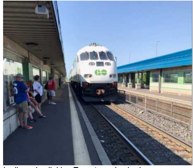
Above: GO Train in Toronto. GO Trains provide regional rail service linking Toronto and suburbs.