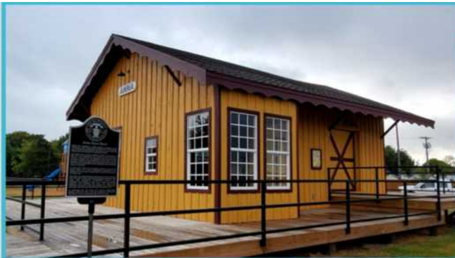
Anna Depot Museum aahps.org