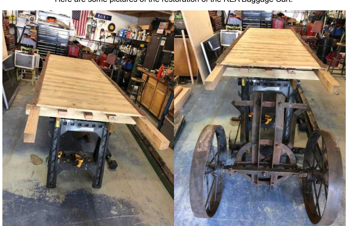
Here are some pictures of the restoration of the REA Baggage Cart.

The Cleburne Railroad Museum is currently closed while being completely remodeled by the City of Cleburne. Tentative reopening should be around Labor Day 2021. The Museum is located at 206 N. Main Street, Cleburne, Texas, TX 76033.