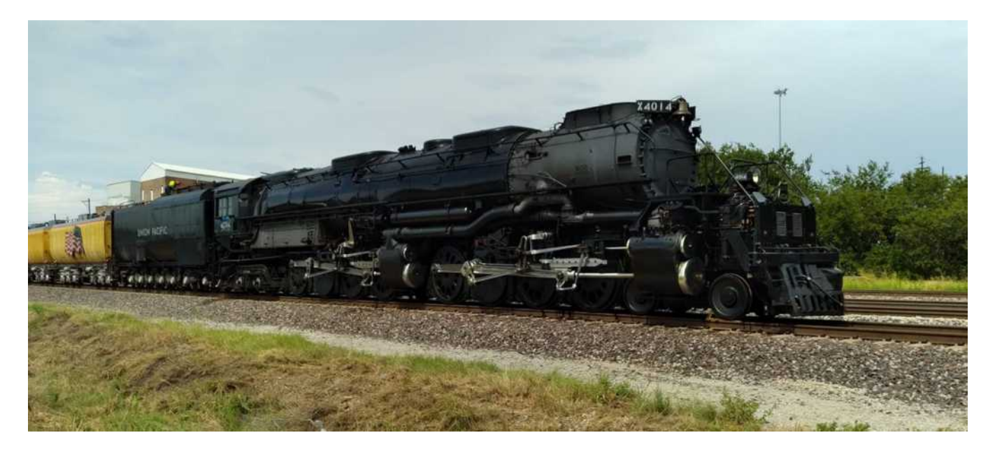
"Big Boy" 4014 in Fort Worth last month... Did you go see it?