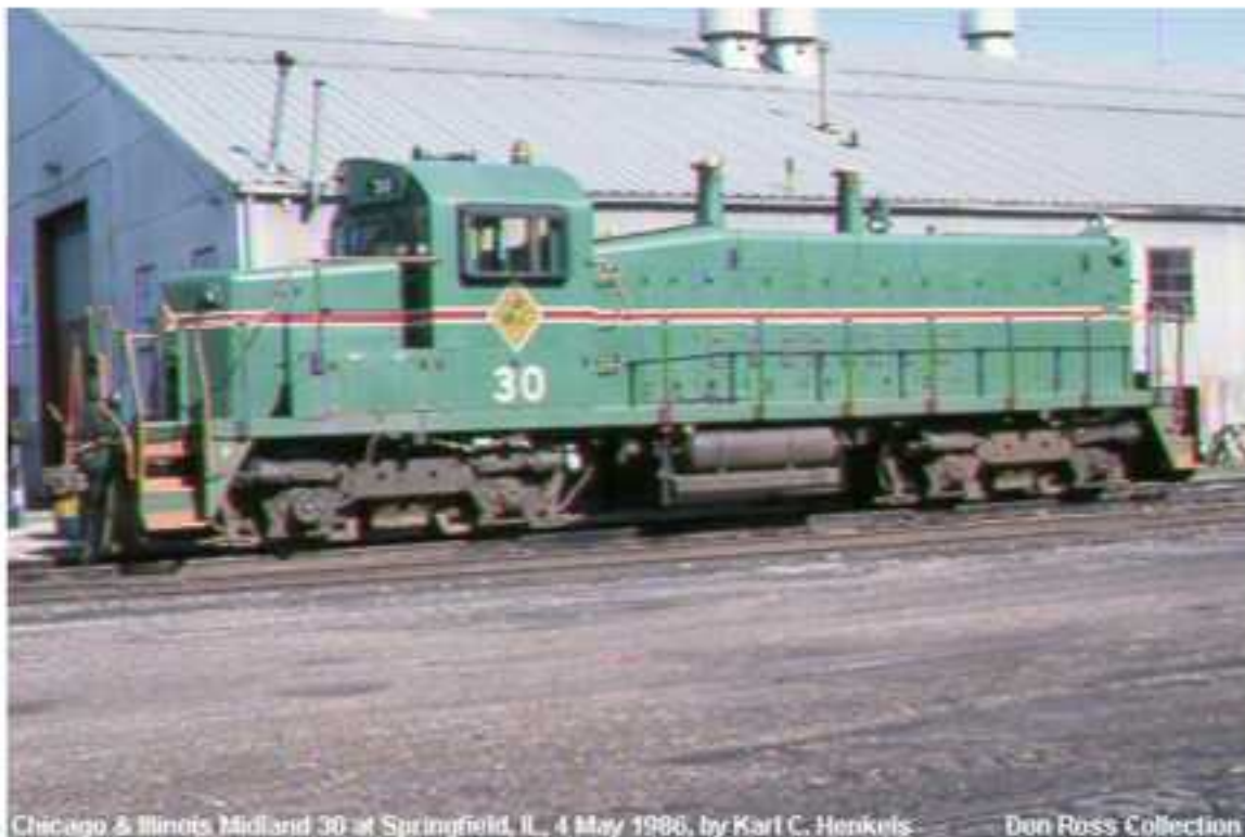
Chicago & Illinois Midland 30 at Springfield, IL, 4 May 1986