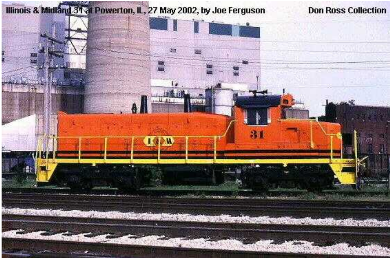
Illinois & Midland 31 at Powerton, IL, 27 May 2002