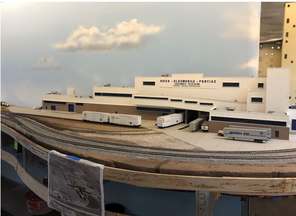
Depiction of the General Motors plant in Arlington