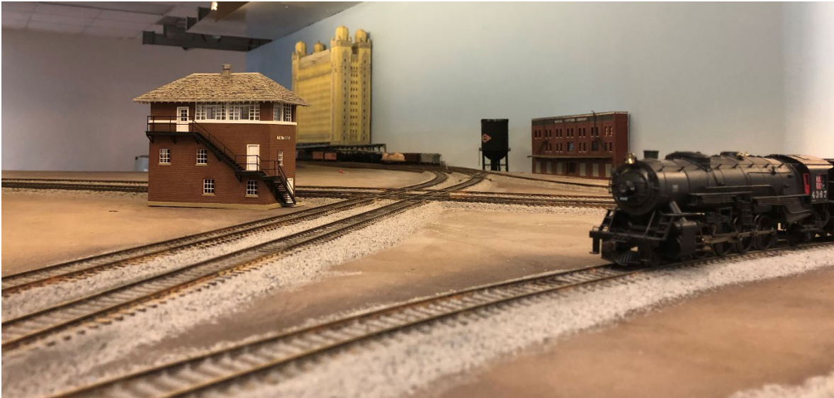
Enlarged Photo from above depicting Tower 55 and the Texas & Pacific Depot in Forth Worth