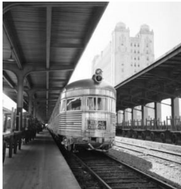
Fort Worth & Denver City, "Texas Zephyr", August 16, 1962