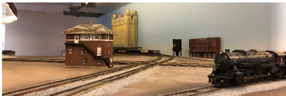
Tower 55 – Model built by Ken Marcoux

The centerpiece of our layout is the iconic structure in Ft. Worth, Tower 55 (see photos above and below). Tower 55 was the control tower and crossroads of all rail traffic going east-west and north-south in Ft. Worth for decades. With Tower 55 as our centerpiece, we focus on recognizable buildings and scenes from Ft. Worth to Dallas and on to East Texas and down to Houston and the Gulf Coast.