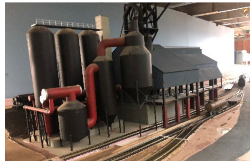
Scene from Texas Western Model Railroad Club

Our layout is HO --- DCC only and we welcome your visits. Come see us in person, or visit us on our website, TWMRC.org and on our Texas Western Model Railroad Facebook page.