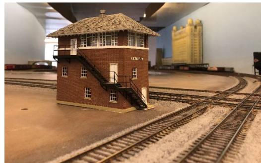
What’s this location?

Do You Find This Picture Intriguing? Then Keep Reading!