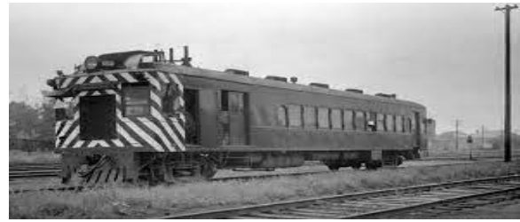
FWD Doodlebug on one of its branch lines in west Texas

April 18 th , DART Service Changes https://www.dart.org/news/news.asp?ID=1638