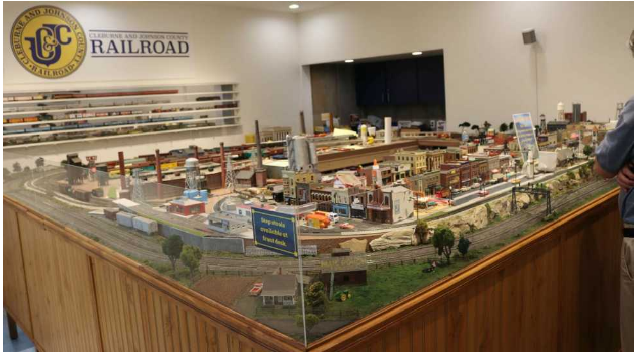
HO Scale Layout found at the Cleburne Railroad Museum