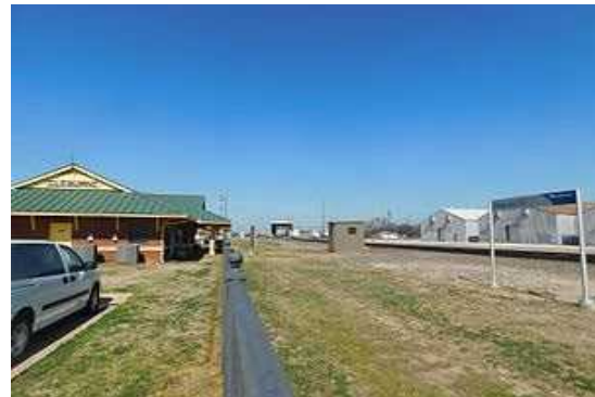
Built in 1999, The Cleburne Intermodal Transportation Depot serves as an Amtrak train station.