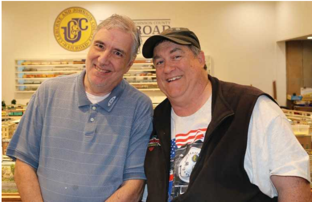
Various displays that can be found at the Cleburne Railroad Museum