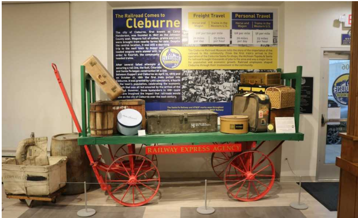
REA Baggage Cart on display that was a restored through a grant from the North Texas Chapter of the National Railway Historical Society