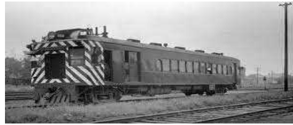
FWD Doodlebug on one of its branch lines in west Texas (BNSF RR)

May 27 th May 28 th , 24 Hours @ Saginaw It's Time to Watch Some Trains