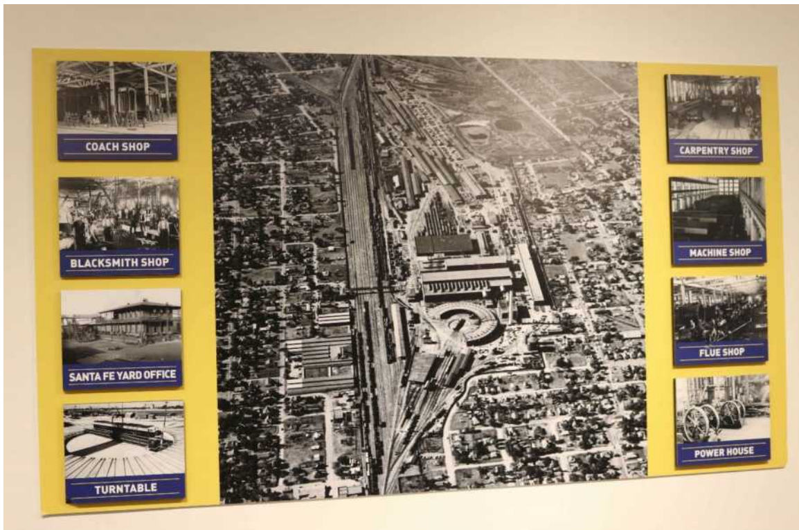
The Famous Cleburne Shops at its Grandest during its Heyday!