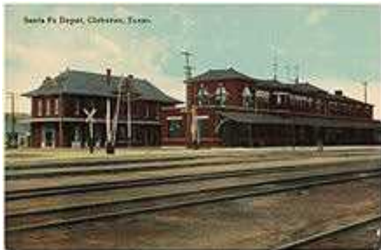
Trinity and Bravos Valley Railway and Atchison, Topeka and Santa Fe Railway depots in 1910. This also included a Harvey House.