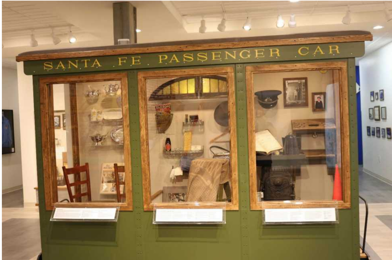
Above is one of many beautiful custom built display cases found in the Cleburne Railroad Museum