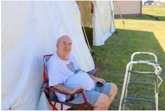
Attendees Settling in at 24 Hours @ Saginaw