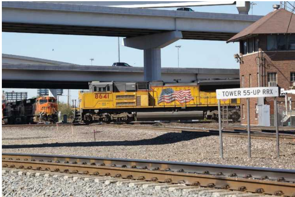
UP Tower 55 Forth Worth, Texas, Date Unknown