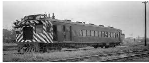
MKT doodlebug M10

July 5 th , NT Chapter Meeting History of Tower 55 by Ken Fitzgerald at Fort Worth Central Station. Starts at 6:00 due to location.