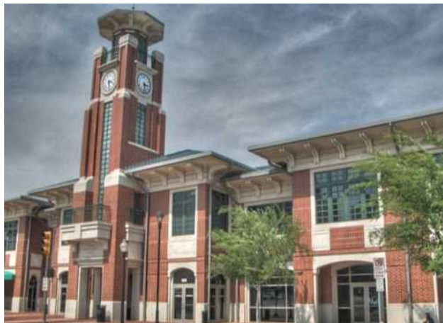
Above: Fort Worth Central Station

Parking: There is no free parking at the facility. However, there are a number of paid public parking lots around the facility. Also, there is metered parking along the surrounding streets.