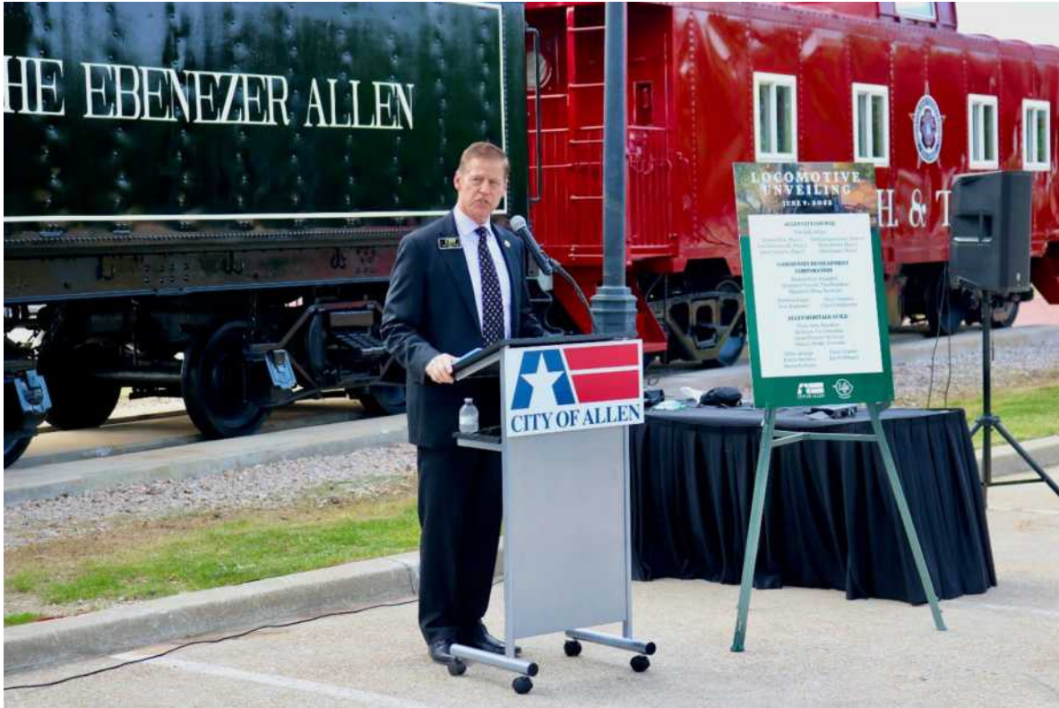
Ken Fulk, Mayor of the City of Allen, is seen above leading the unveiling event.