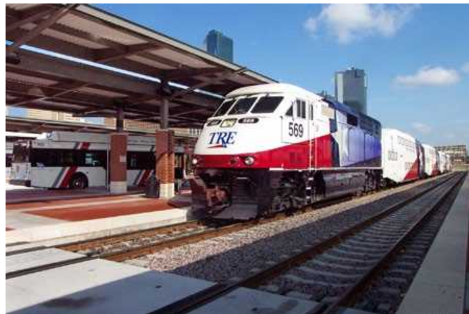
Above: Trinity Railway Express trainset at Fort Worth Central Station