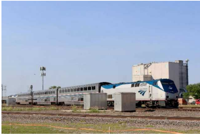
Amtrak Heartland Flyer