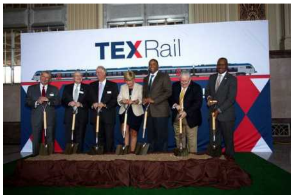
TexRAIL T&P Groundbreaking Event 2016-08-24