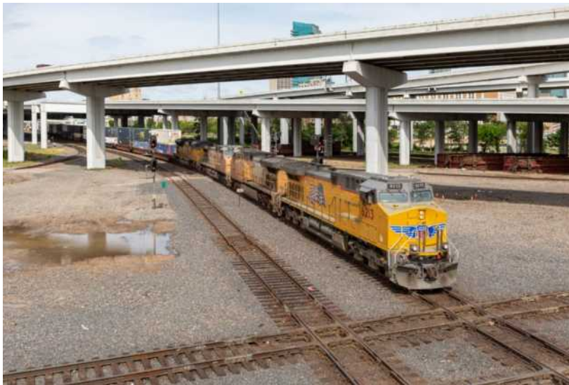
Left Photo by Ken Fitzgerald of a UP stack train from Tower 55 on April 25 th , 2022

Ken covered the BNSF's Abo Canyon double track project in New Mexico from 2005 to 2011. Ken photographed multiple events around the country for the Union Pacific's 150th Anniversary in 2012.