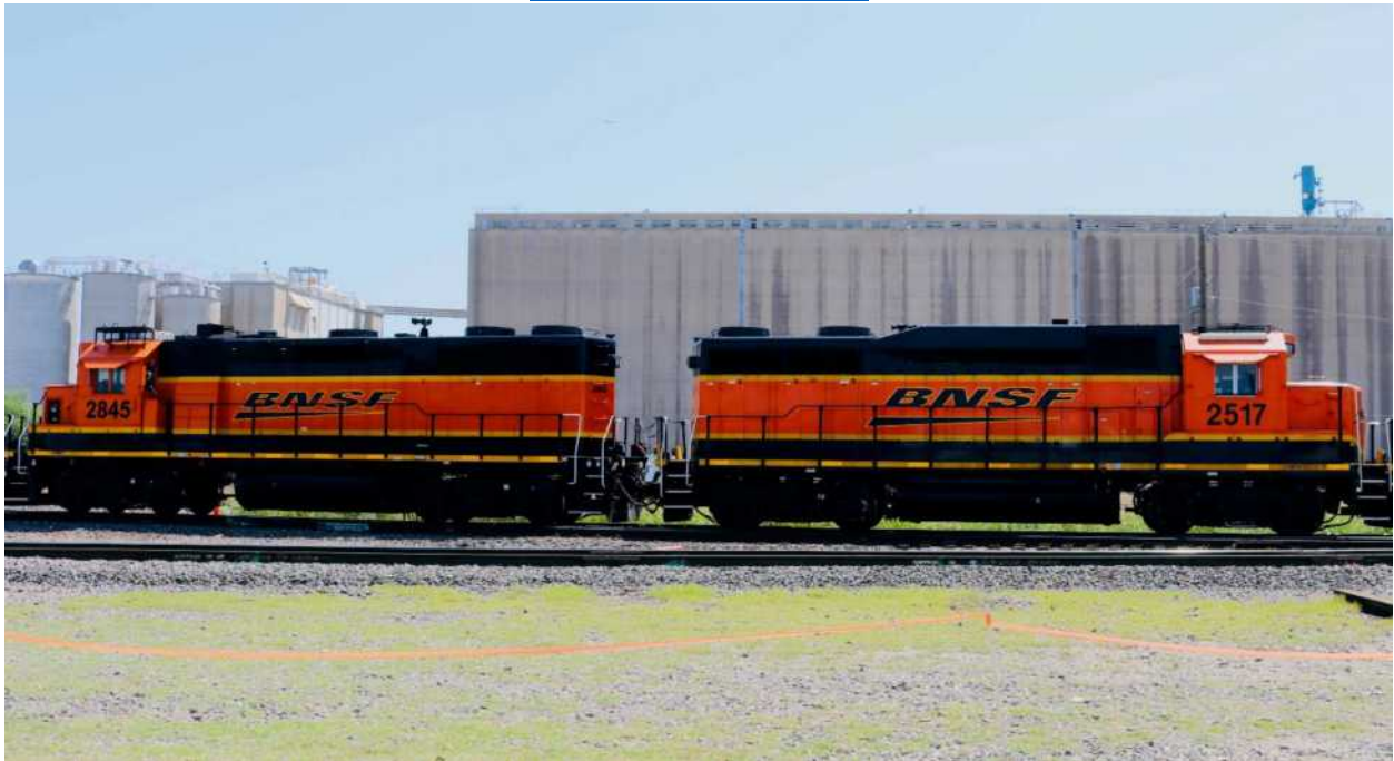
The pair of locomotives pictured below was seen making several switching maneuvers in the Saginaw Yard during 24 Hours @ Saginaw