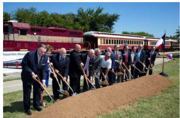
TexRAIL N. Richland Hills Groundbreaking Event 2016-08-24