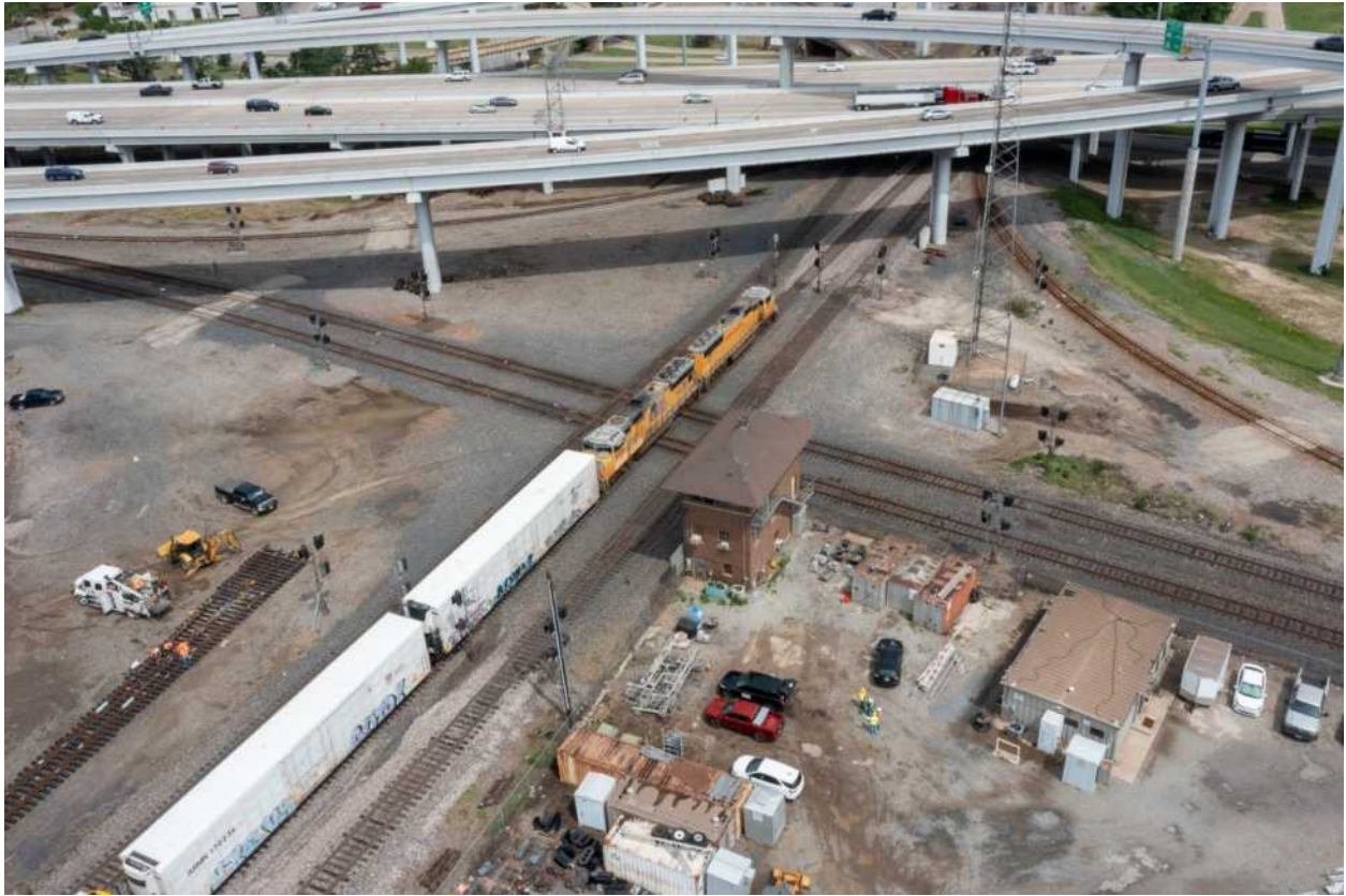
Photo Taken by Ken Fitzgerald at the controls of his drone on April 25, 2022.

Ken worked as the UP's photographer with their train at the Democratic and Republican National Conventions in 2008.