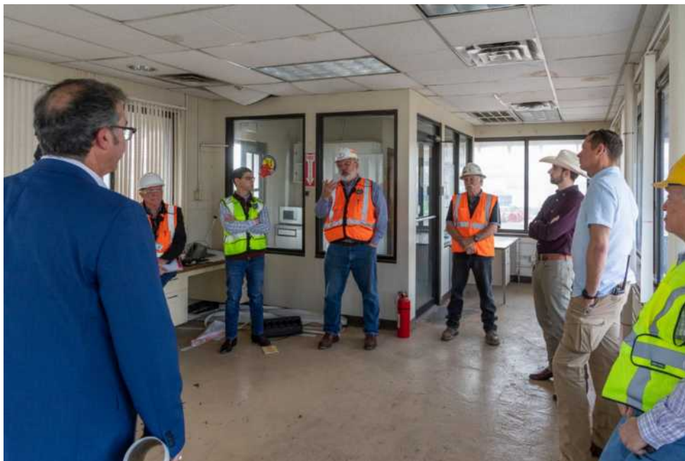
The Third Floor of Tower 55 (now void of any radios, switch levers or control panels) is just a shell of its former self as shown on April 25 th with a group that came together to discuss options for saving Tower 55. Photo taken from opposite side of the third floor showing access to the stairs and mini kitchen.