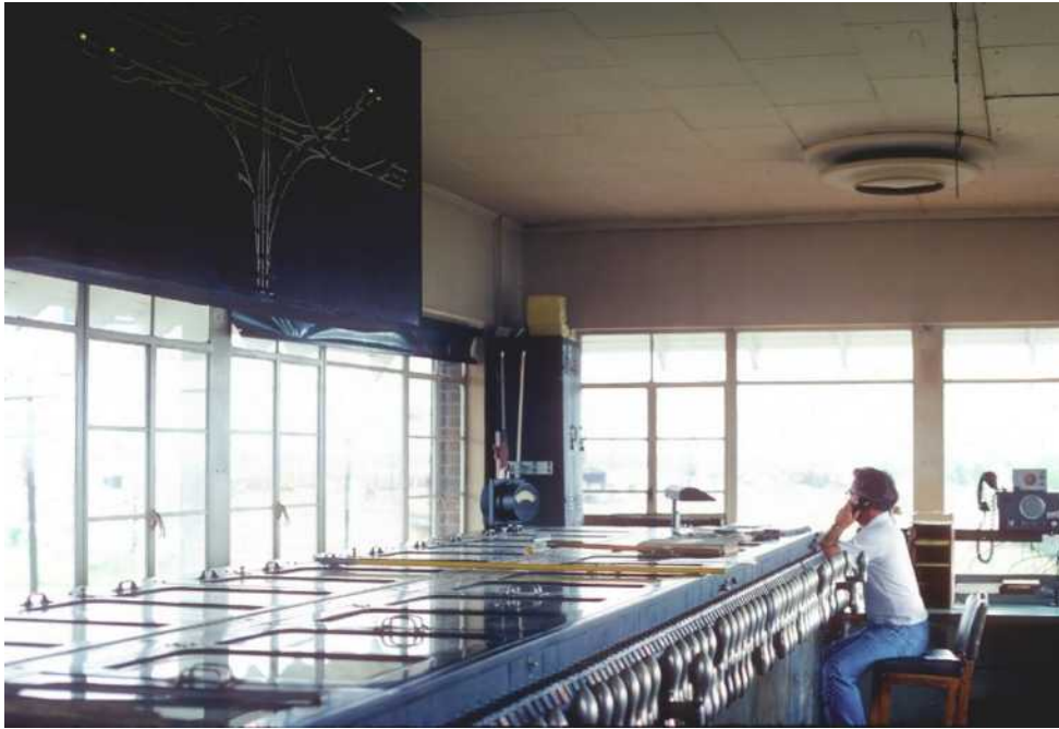
Third Floor of MP Tower 55 Fort Worth, Texas, taken on 6-14-81