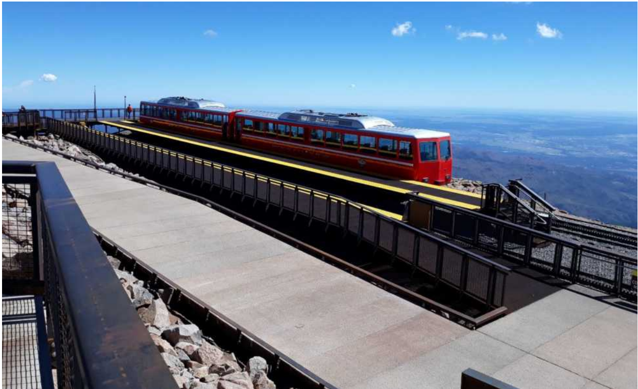
Jon's cog train at the summit of Pike's Peak: Highest Train in North America