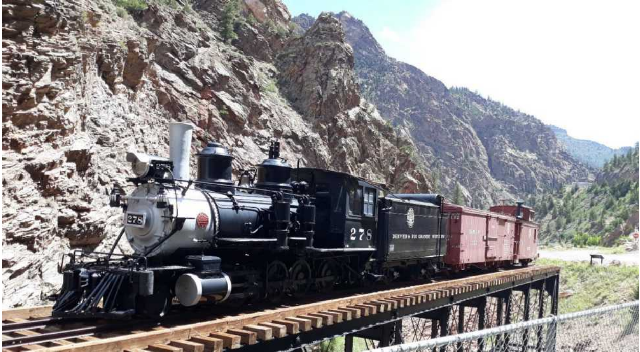
Beautifully restored Denver and Rio Grande Western train with 2-6-0 narrow gauge engine seen on former site of the railroad bridge over the Gunnison River in Curecanti National Recreation area, CO.