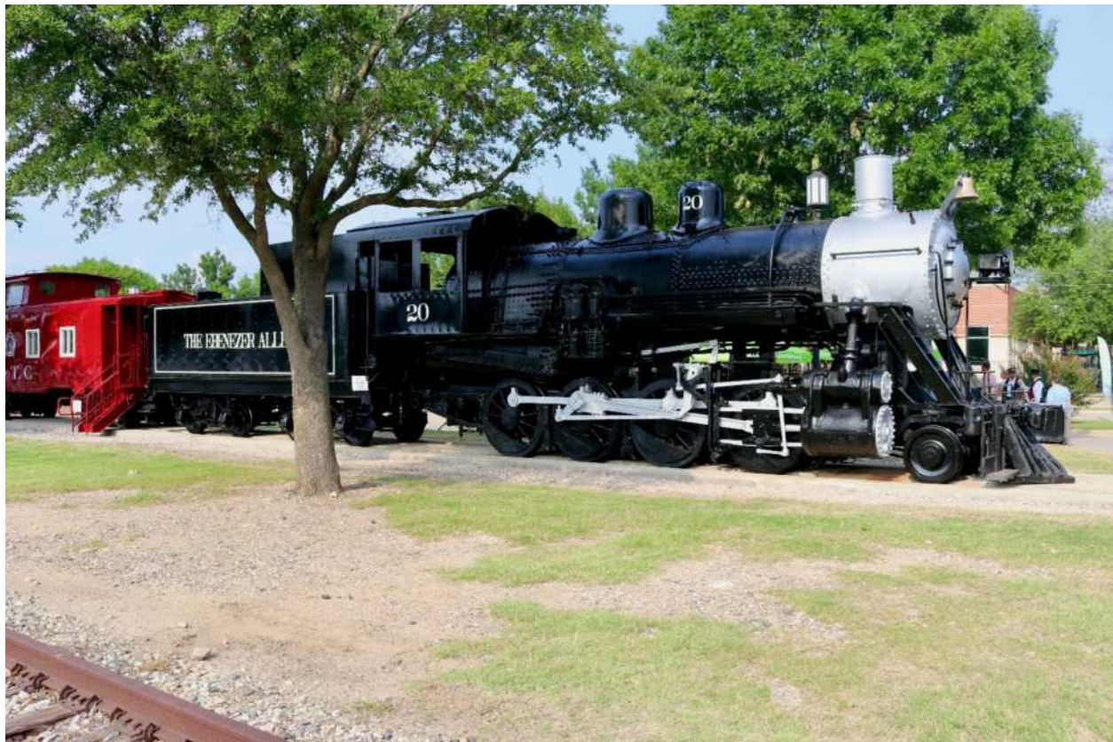
According to the Allen Heritage Guild website, originally the caboose was used on the Rock Island Lines. It was built in 1930 and modified in 1955. It is steel framed with a wood roof covered with canvas. The cupola is off-center which usually indicates that the short stretch of roof top is the back. The caboose is 29 feet long with an inside width of 8½ feet. It weighs 47,400 pounds.