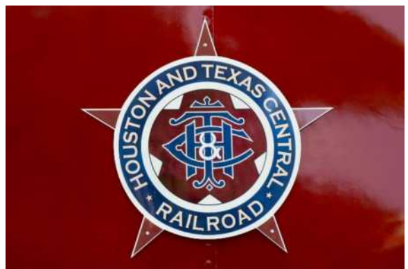
H&TC emblem on the caboose