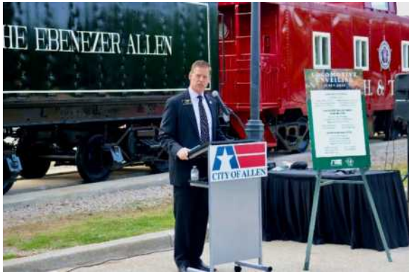
Ken Fulk, Mayor of the City of Allen, leading the unveiling event