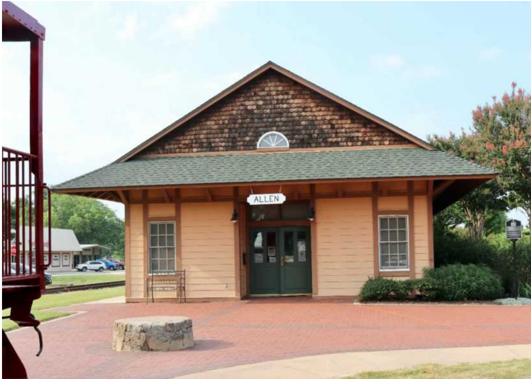
The only structure remaining from the original depot (it burned down in the 1940 s) site is the old cistern located on the south side of the building, pictured above between the end of the caboose and the depot.