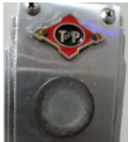
Top of an Art Deco era door handle leading into the men's room at the T&P Depot.