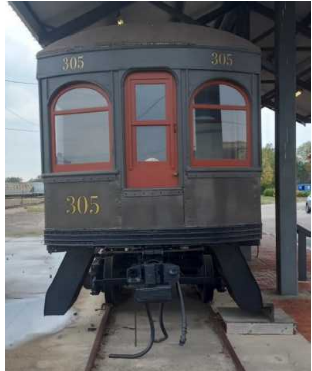
The rear of Southern Traction Co. Car 305.