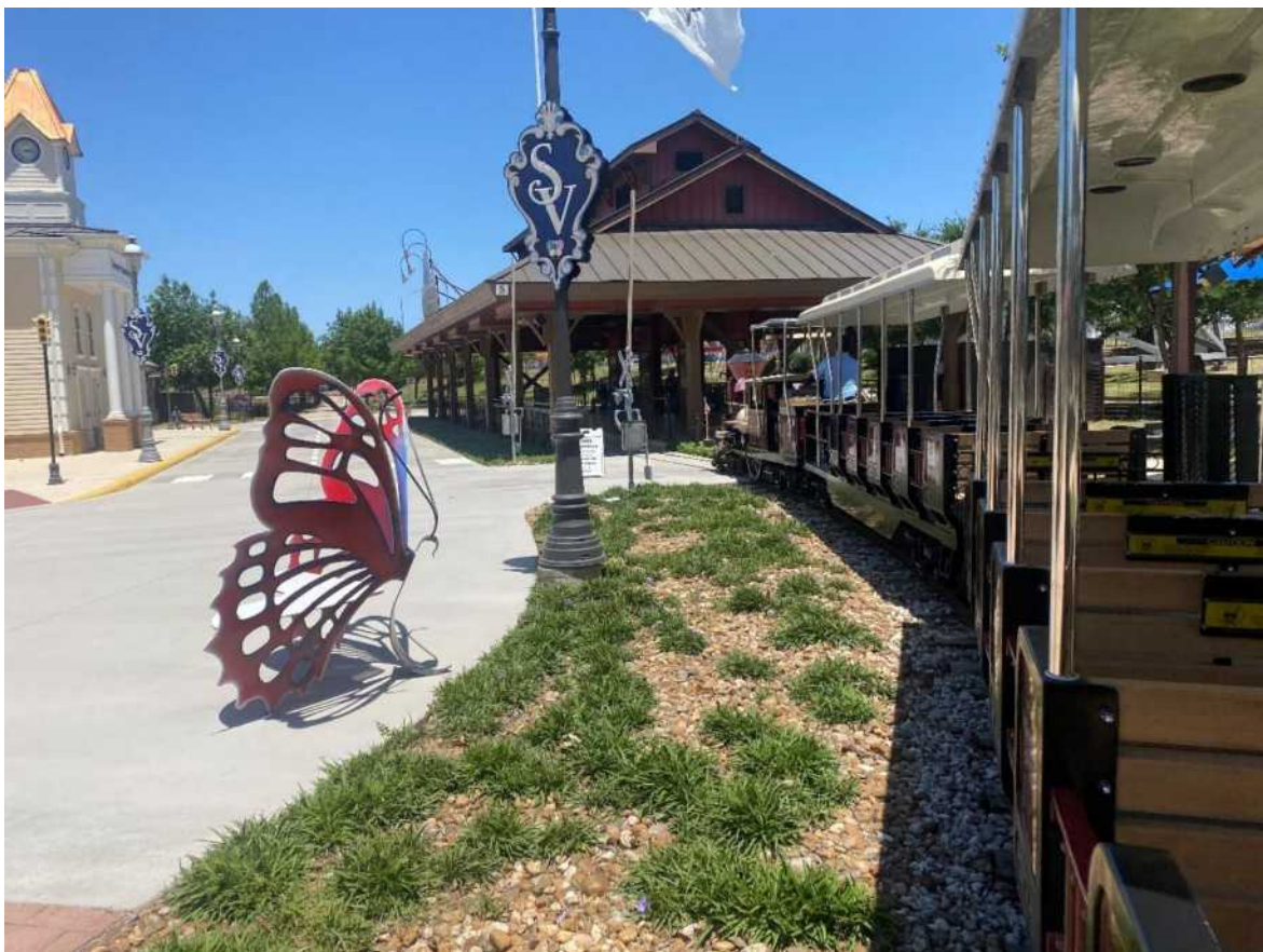
Our train is seen pulling into the Wonderland Depot looking like any amusement park but with special accessibility for all!