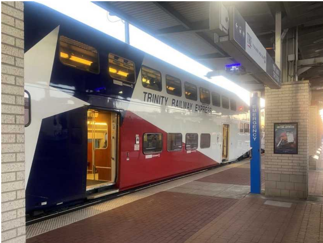
Above: The TRE (Trinity Railway Express) is “now boarding” on Track 6.