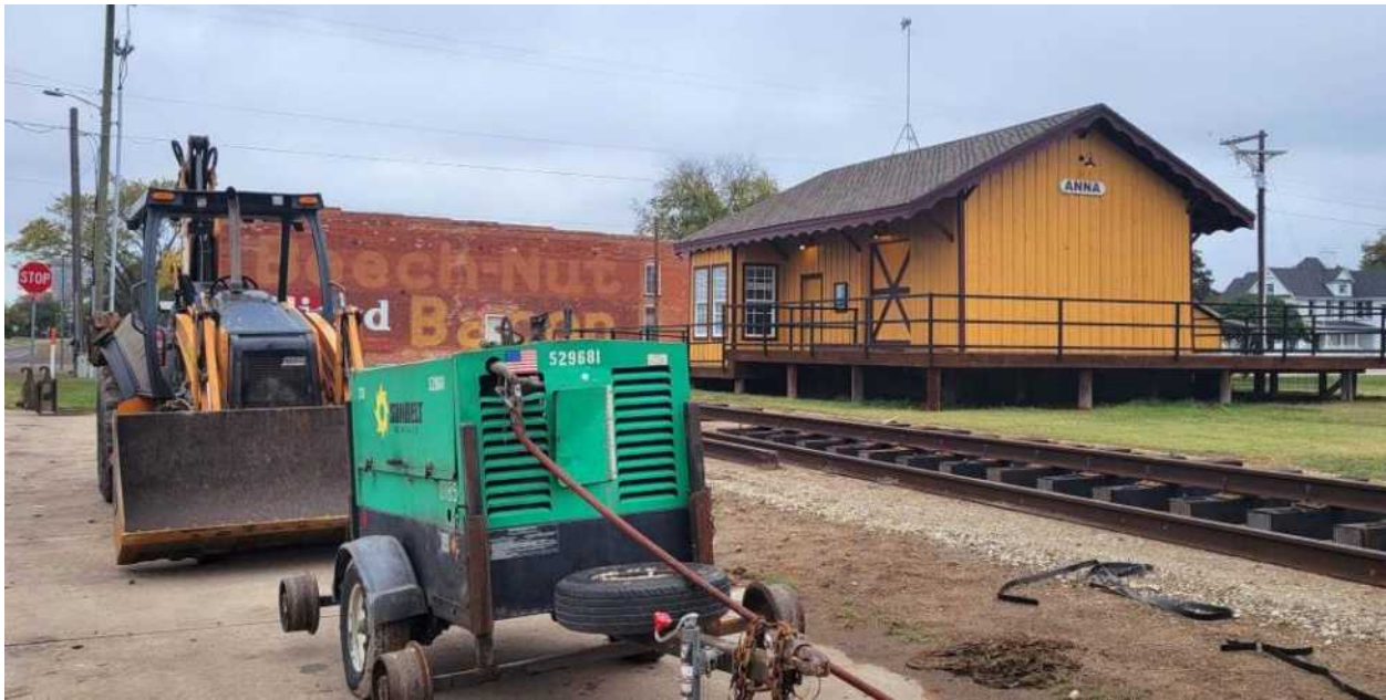
A Historic area of Anna is seen from the opposite direction in November 2022.