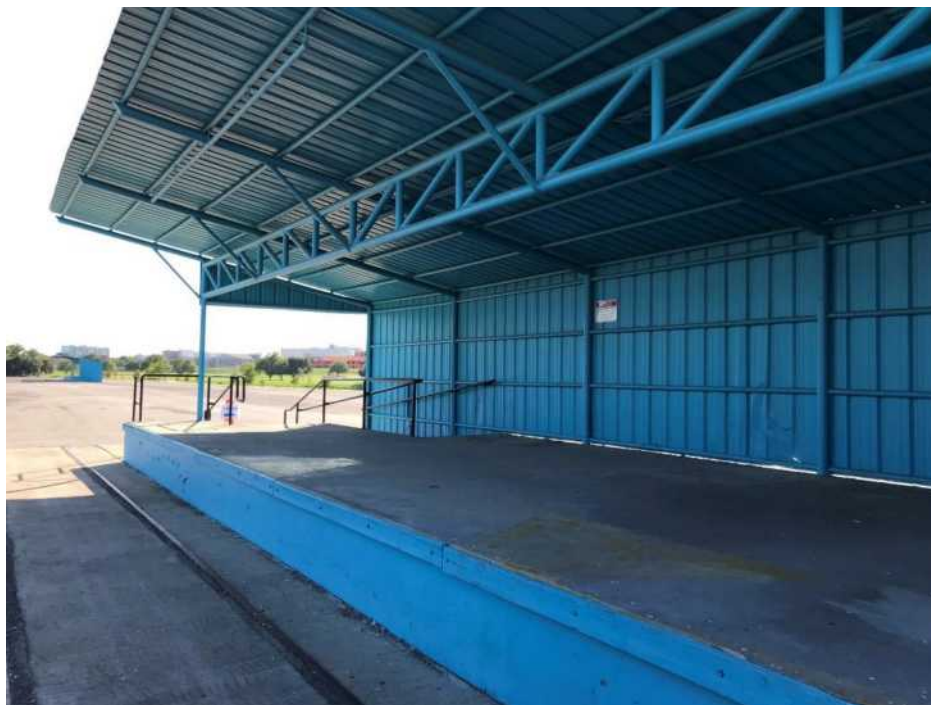
Pictured Above: One of the four stations (Stop 2) in the parking lot looking just like it did back in the day. If you look close, there is another station in the background (Stop 3) on the left hand side of the photo. The stations were saved and are currently used as stages for entertainment venues. Sections of the track also still remain.

https://en.wikipedia.org/wiki/Tandy_Center_Subway