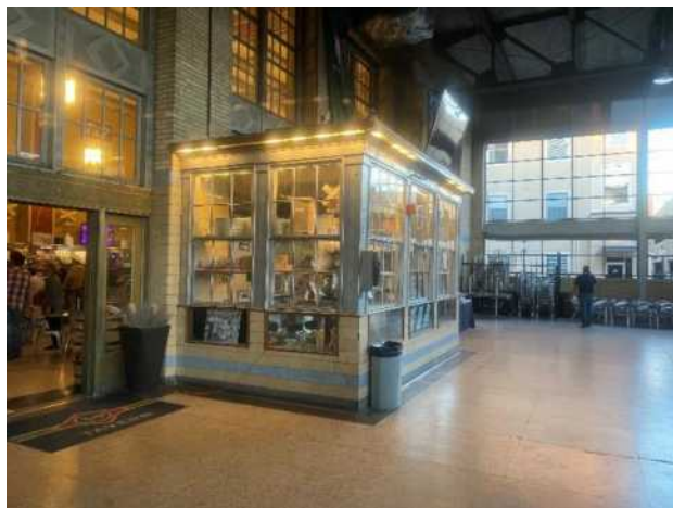
Former News Stand at the T&P Depot. It is now a part of the T&P Tavern.