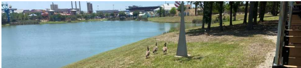
The train runs around the perimeter of the park including a nice size lake with ducks to greet the train.