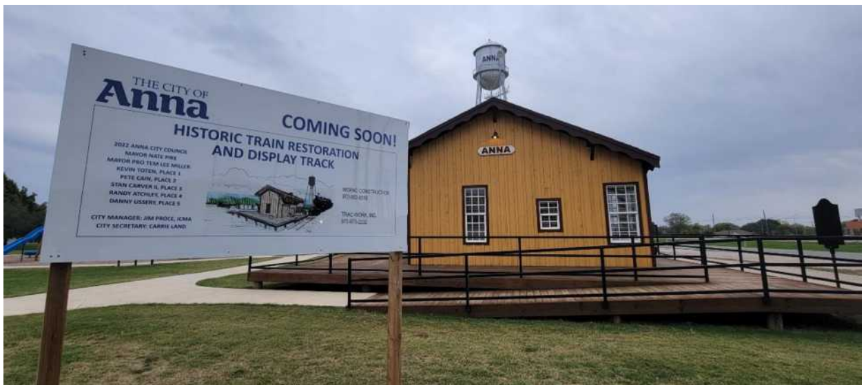
The City of Anna: Coming Soon! Historic Train Restoration and Display Track.