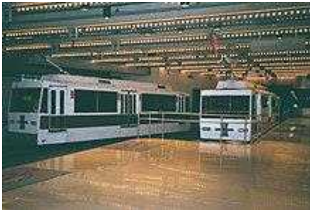
Tandy Streetcars at the underground terminal in 2002

The Tandy Corporation purchased the department store, its parking lots, and the subway in 1967. The corporation built its headquarters, the Tandy Center, on the site in 1974. Although it demolished the original store, Tandy retained the subway.