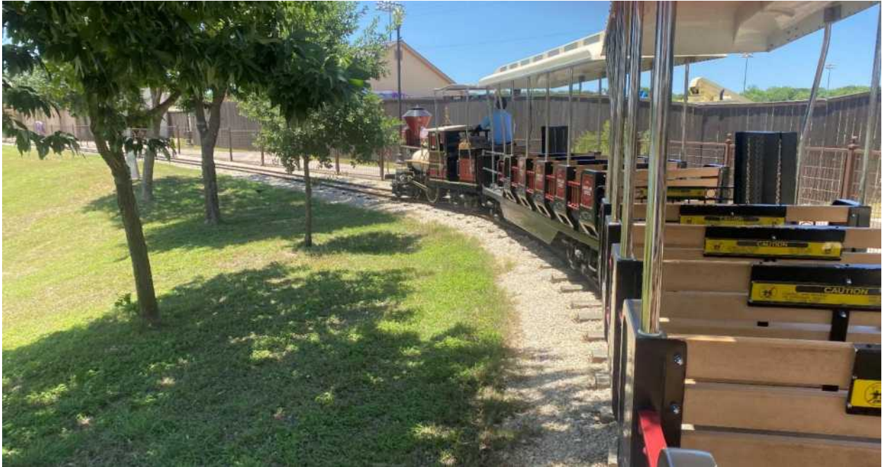
As we round a bend, the ramps can be prominently seen at the front of each coach with space to fit any size wheelchair.