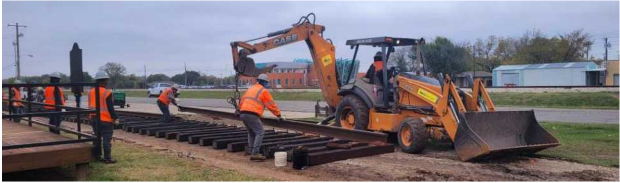
Track was being laid in preparation for the arrival of #201 in November 2022.