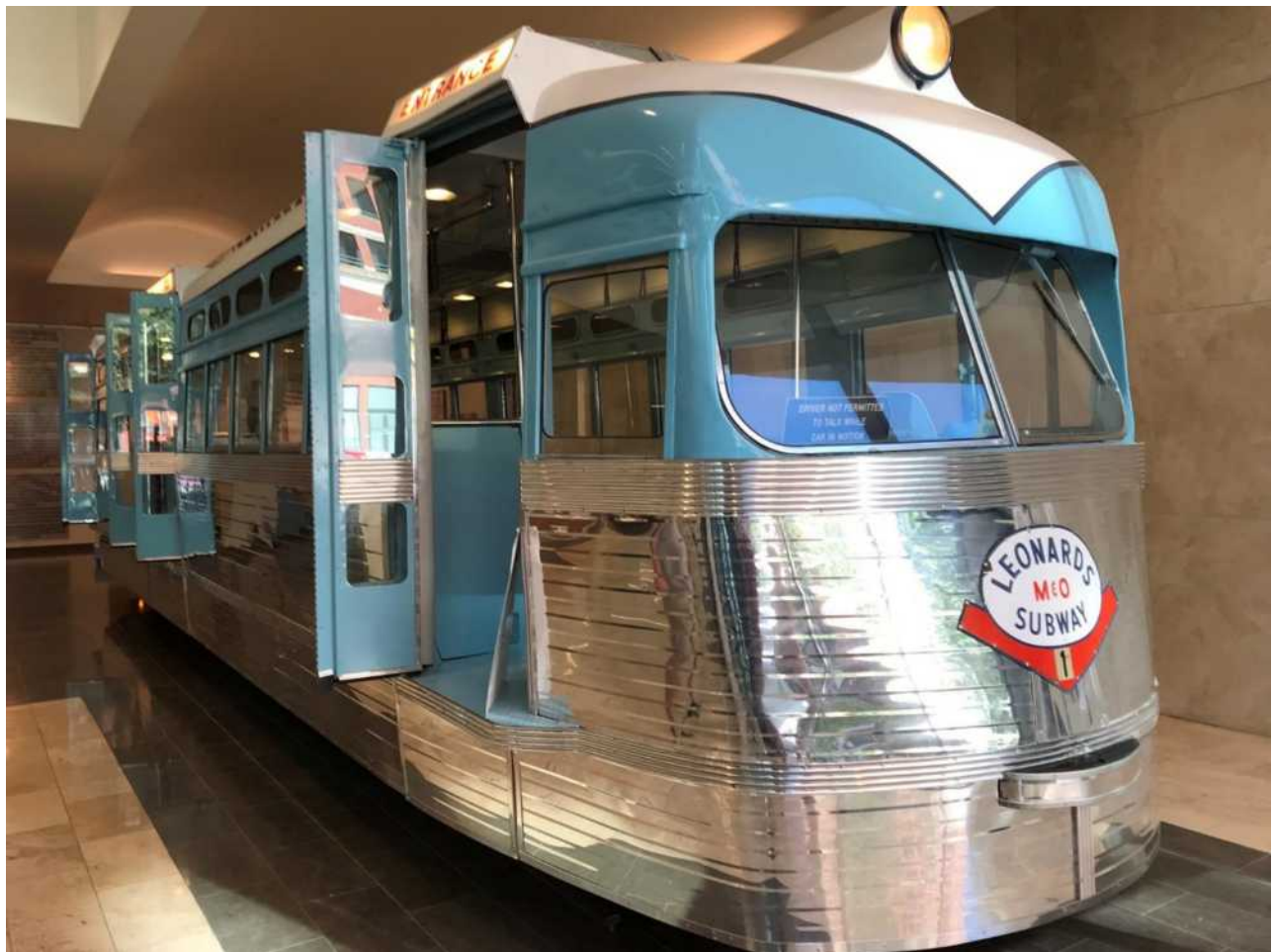
Leonard's number one is now on public display in the lobby of Texas Capital Bank, Fort Worth (One City Place).