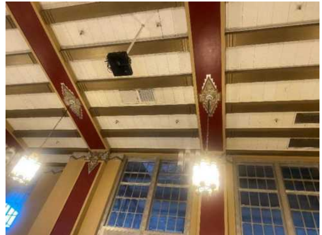
The T&P Depot and Diner are famous for their Art Deco Designs as seen in the current Tavern.