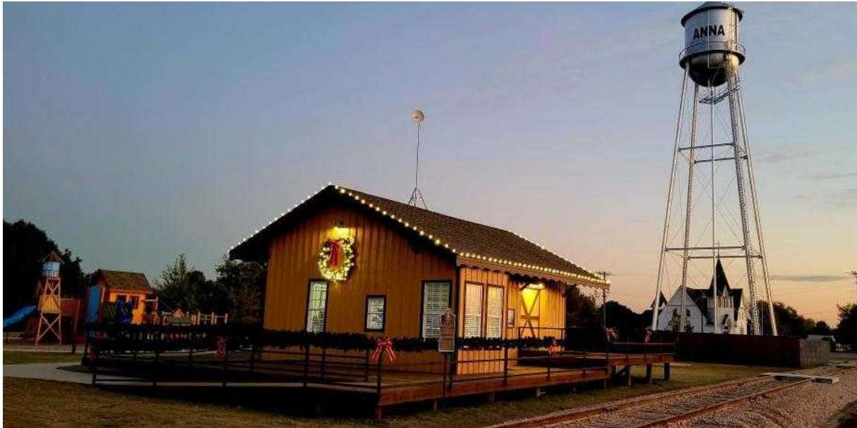
This looks like a Christmas Scene from many decades ago with the historic depot and the historic church in the background, just ignore the playground! It will be postcard perfect when Mogul 201 is in place.