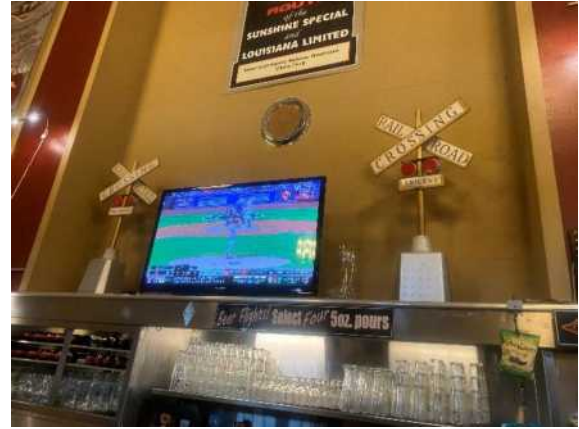
Some of us met for dinner at the T&P Tavern before the October meeting.