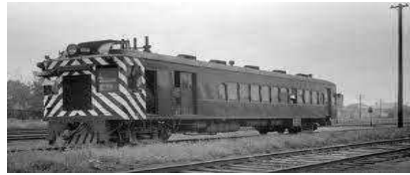
MKT doodlebug M10

November 12, 2022 - January 6, 2023, The Trains at NorthPark Annual Event. See link for more details - http://www.thetrainsatnorthpark.com/