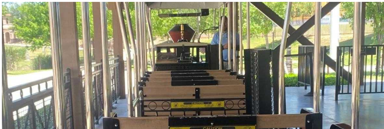
Above: Looking from inside the second coach, a retracted ramp can also be seen on the right.