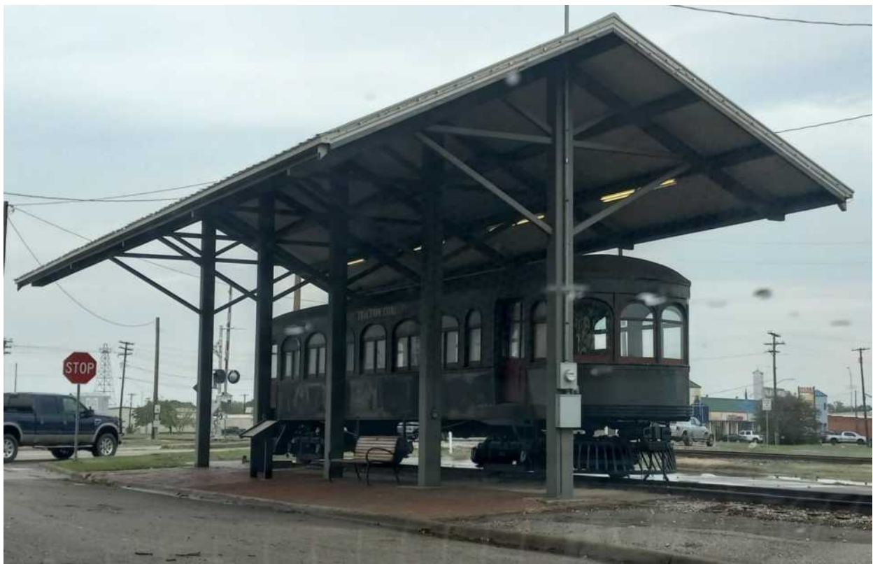
Southern Traction Company Car 305 was put on public display in the City of Corsicana next to the Visitor's Center in 2009.