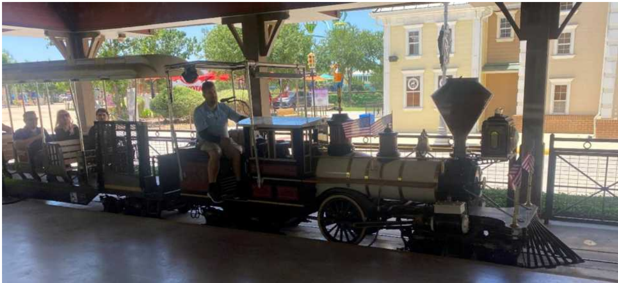
Above: Directly behind the locomotive, a retractable ramp can be seen at the front of the coach.

The Wonderland Express has a special retractable ramp on each car that allows guests in wheelchairs to load themselves and their chairs directly onto the train. See the editor’s photographs below.