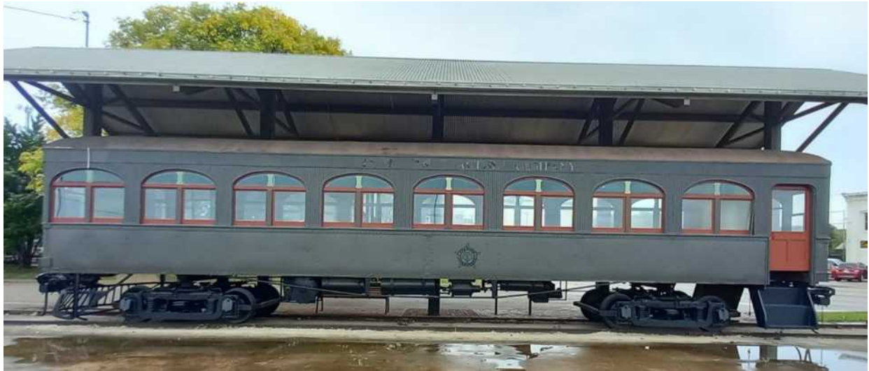
Southern Traction Company Car 305 on display in Corsicana TX.

car-body were restored leaving the interior unfinished. It was put on public display in the City of Corsicana next to the Visitor's Center in 2009. See related pictures below.