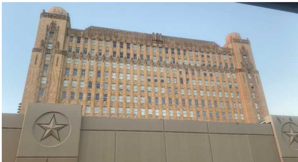
Above: Track side photograph of the Texas & Pacific Depot.