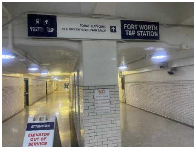
Underground tunnel leading to Rail Platforms and Parking Garage.