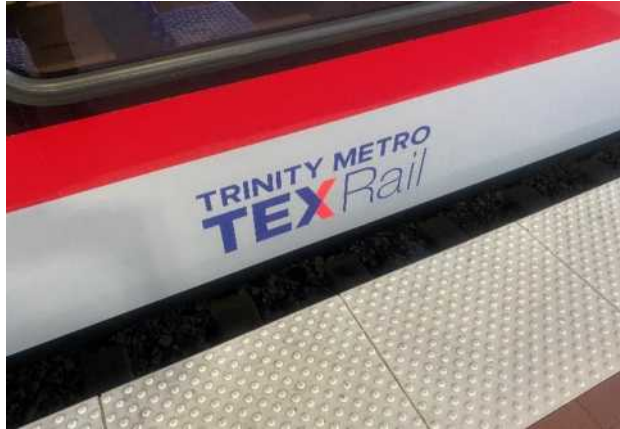
Trinity Metro TEXRail logo on the side of a departing train.