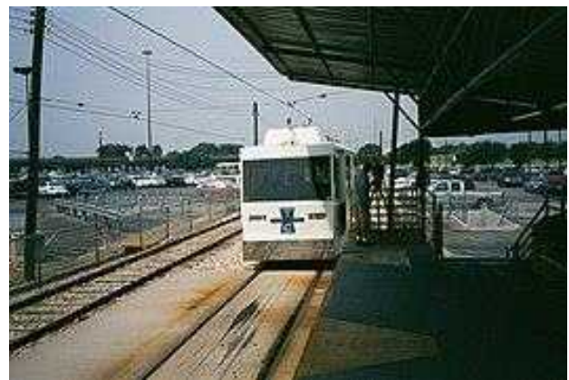
A Tandy Center Subway car on the last day of service in 2002

The small subway primarily served patrons visiting the mall at the base of the Tandy Center, which also linked to the downtown location of Fort Worth Public Library. However, the anchor tenant moved out in 1995 and the mall declined. The Tandy Center Subway ceased operation on August 30, 2002.