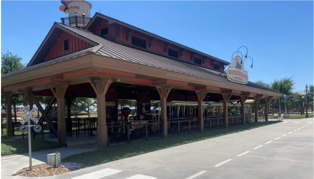
The Wonderland Express Depot can be seen above with a faux water tower in the background.