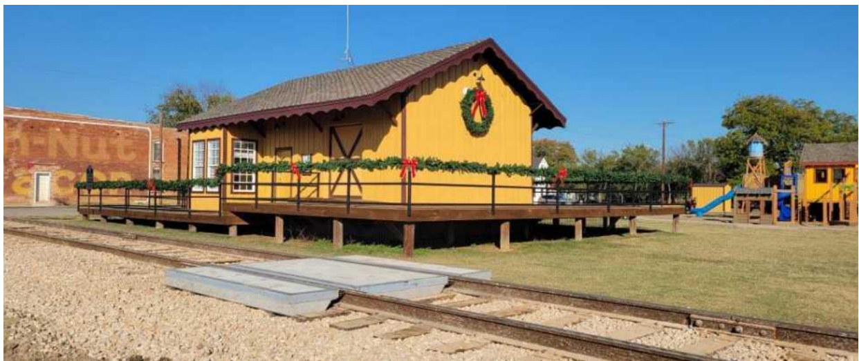
Track work was completed Mid-November and was waiting for the arrival of #201.