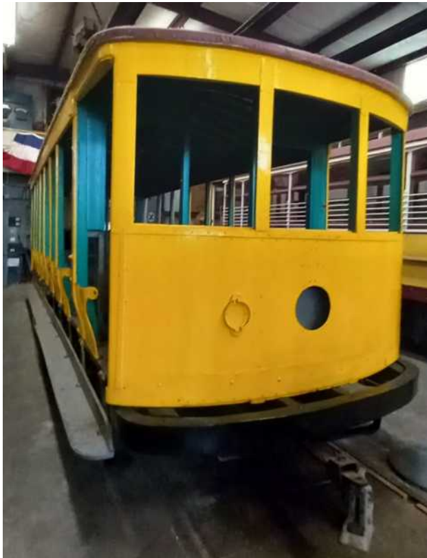
The open air brill from 1908 is Veracruz #9