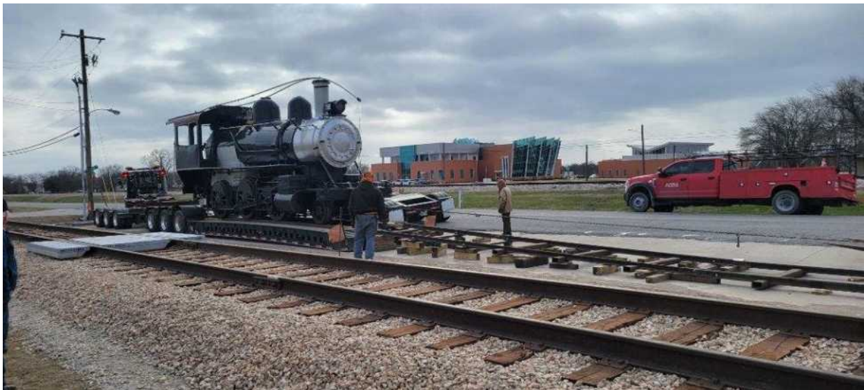
Above (and Below): Rolling the engine off the trailer is a very slow, "easy does it" process.