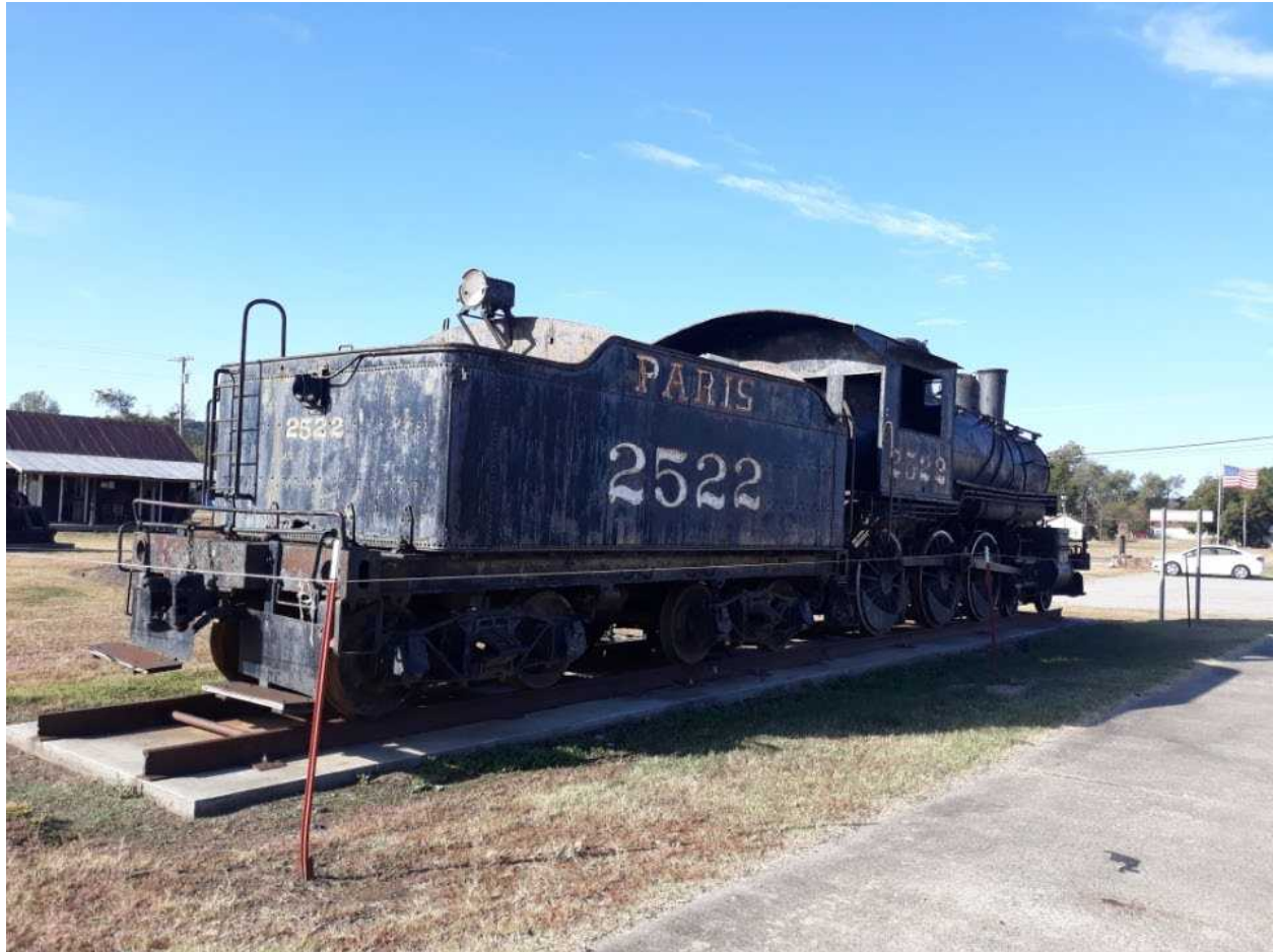
Above: Rear Three-Quarter View of Missouri Pacific #2522 seen in Paris, Arkansas