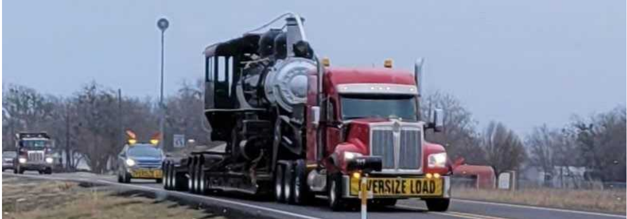
Above: Mogul 201 is shown here west bound on FM 445, White Street just east of downtown Anna.