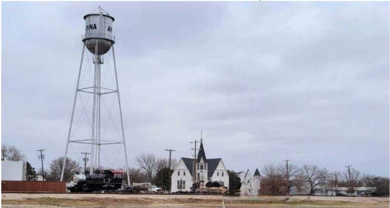
Above: Locomotive #201 is seen sitting on its temporary track after unloaded from the lowboy rig.