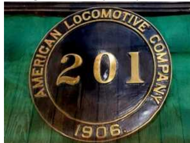
Above: This is the original number plate and will not be installed on the locomotive. The plan is to manufacture a replica for use on the locomotive to prevent souvenir collectors removing it.