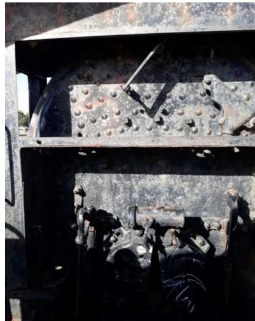
Right: Partial view of the inside of cab #2522