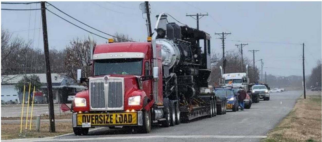
Above: Mogul 201 passing First Christian Church.