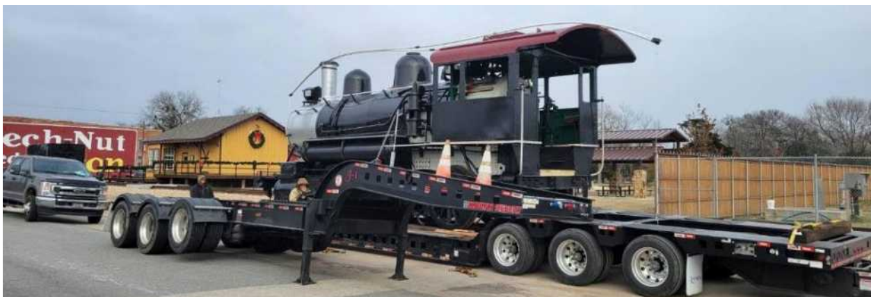
Above: Preparing to lower the front end of the trailer and begin off-loading the engine (notice the tender is already on the display track).