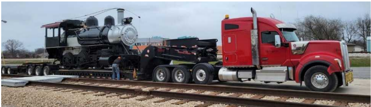
Above: Disconnecting the jeep (front set of load sharing wheels).