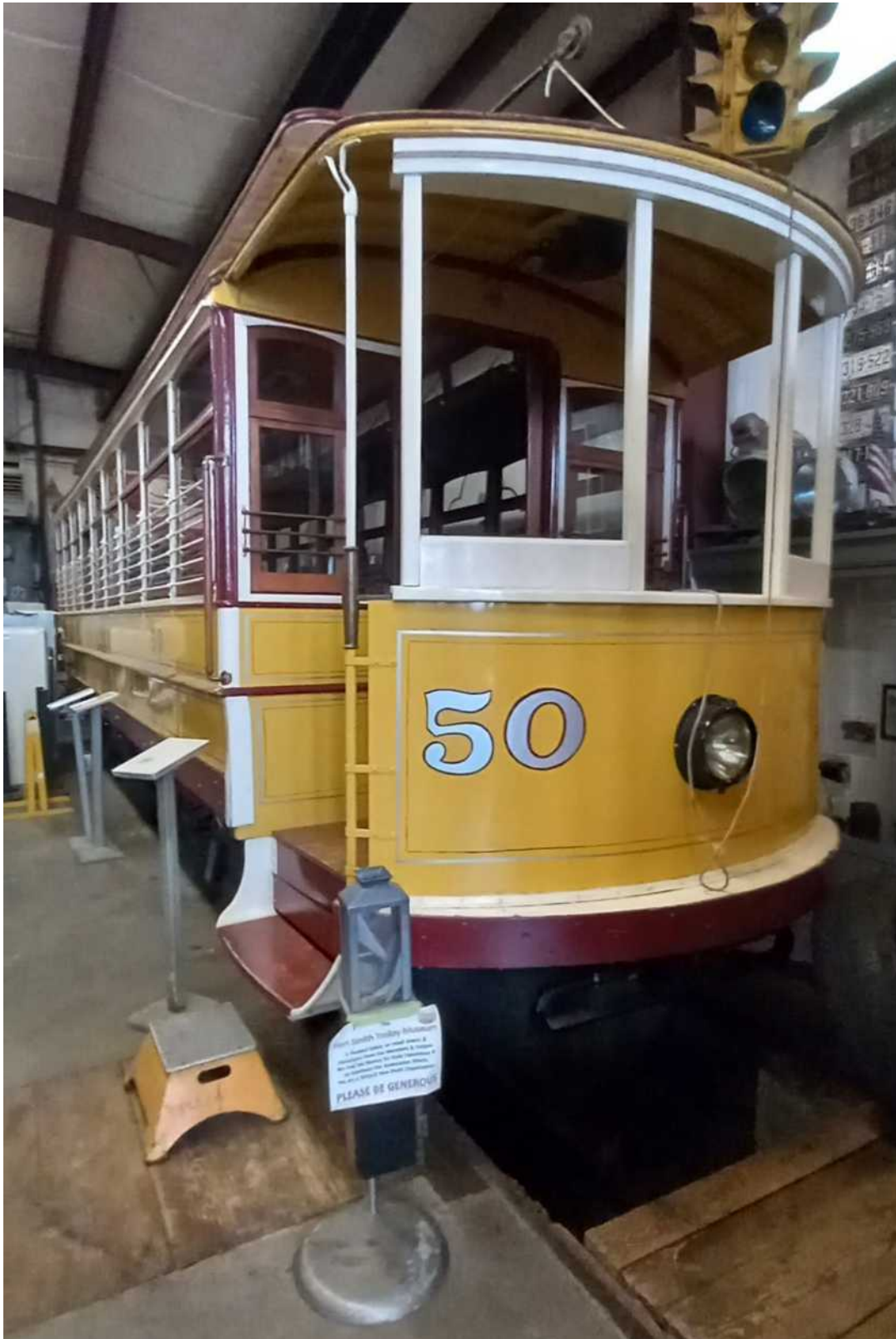
The big car is Hot Springs 50, a double truck Saint Louis deck roof car.