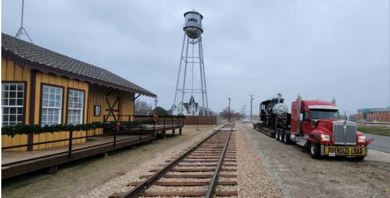
Above: Arriving at Anna Depot and Museum.

Below are various scenes of 201 arriving and being prepared to be unloaded near the Anna Depot.