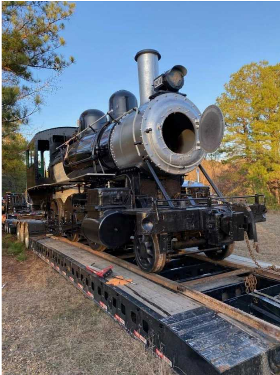
Mogul #201 was being prepped for its journey to the great state of Texas.

After multiple delays for multiple reasons, Mogul 201 finally left Arkansas, and arrived in Anna, TX on Thursday, December 22 nd , 2022. The locomotive and tender were loaded on separate trailers and left Arkansas as a convoy. Even though the locomotive is shown being unloaded first in the series of photos below, the tender arrived first and was unloaded first. The tender was unloaded directly onto the permanent display track because it was on a tiltable rig. The locomotive was not on a tiltable rig due to its size. The plan was to use shoo fly track sections to leapfrog the locomotive from the lowboy to the permanent display track, but due to the extreme low temperature, the locomotive was unloaded on a temporary track due to concerns of something breaking in the process.