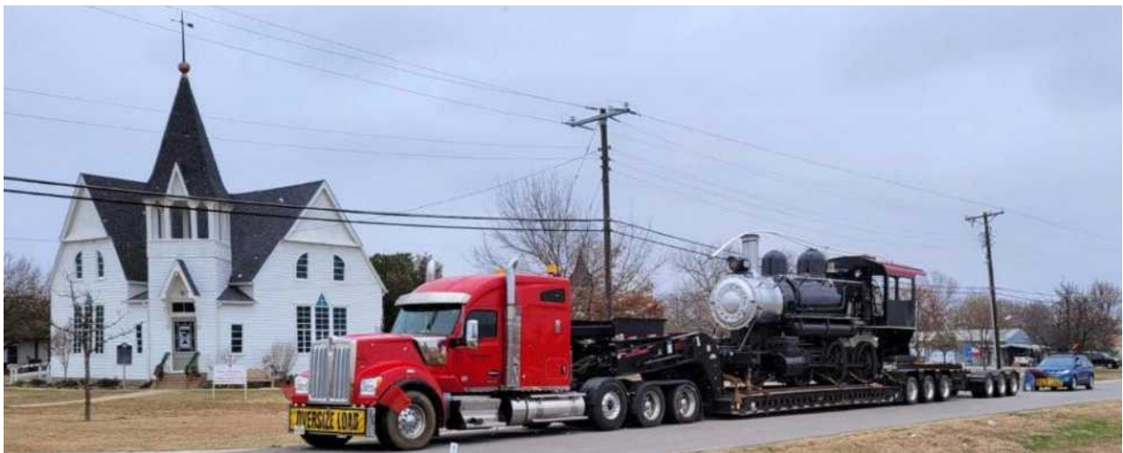
Above: Mogul 201 is seen arriving in Anna in the series of pictures above. The bottom photo includes the historical First Christian Church in Anna.