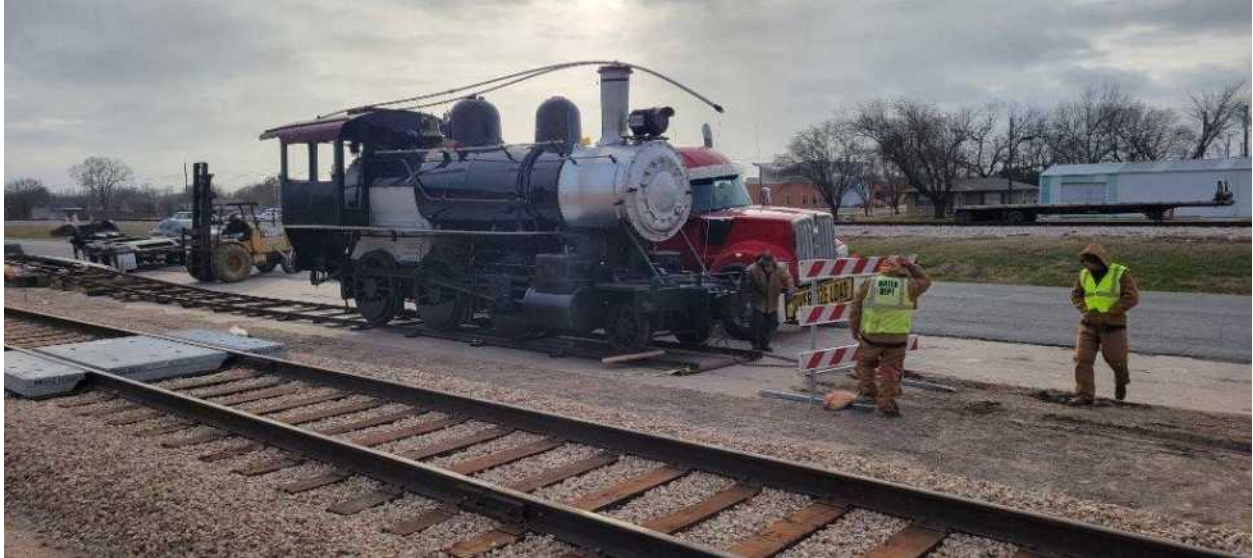
Above: The engine is clear of the low boy and tied down on temporary track. Due to extreme cold and wind, it will remain here for a few days.