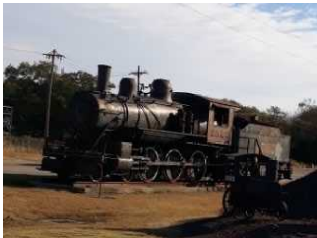
Above: Another angle of MP #2522, Paris, AR