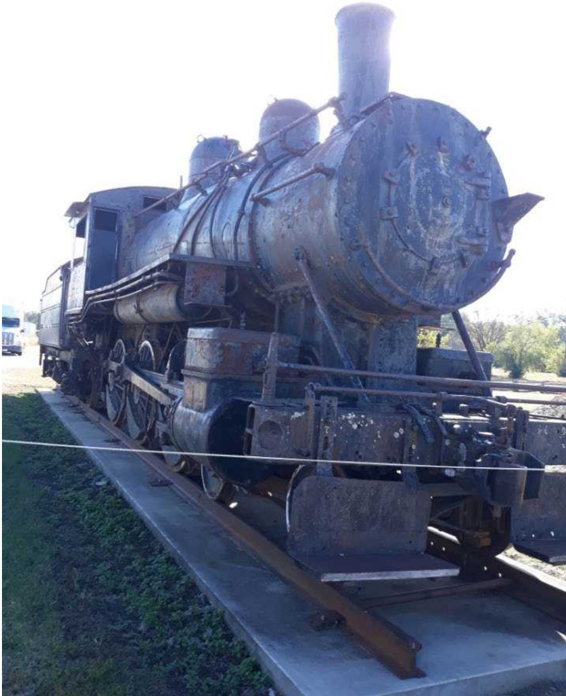
Above: Front Three-Quarter View of Missouri Pacific #2522 seen in Paris, Arkansas