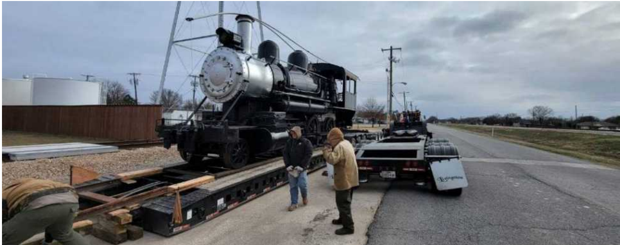
Above: Shoo fly tracks being shimmed so the engine can be rolled off the low boy.

Below are photographs of Mogul 201 being set on a temporary track.