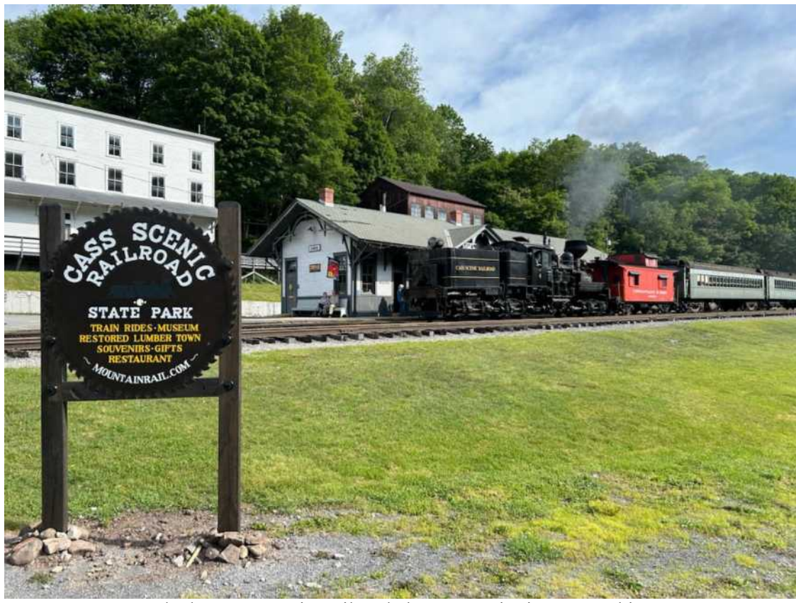
We rode the Cass Scenic Railroad along a scenic river to Durbin, WV.