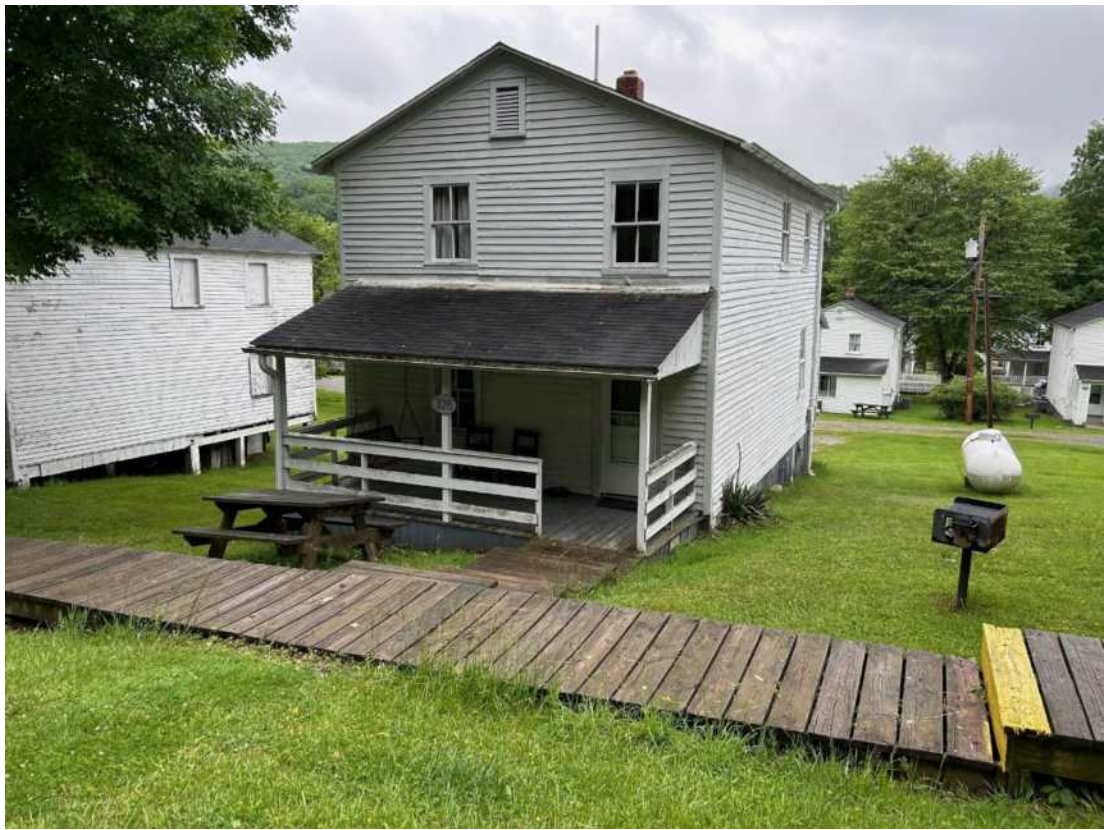
Sawmill town company housing restored by WV State Parks at Cass. We stayed in this one for 3 nights.