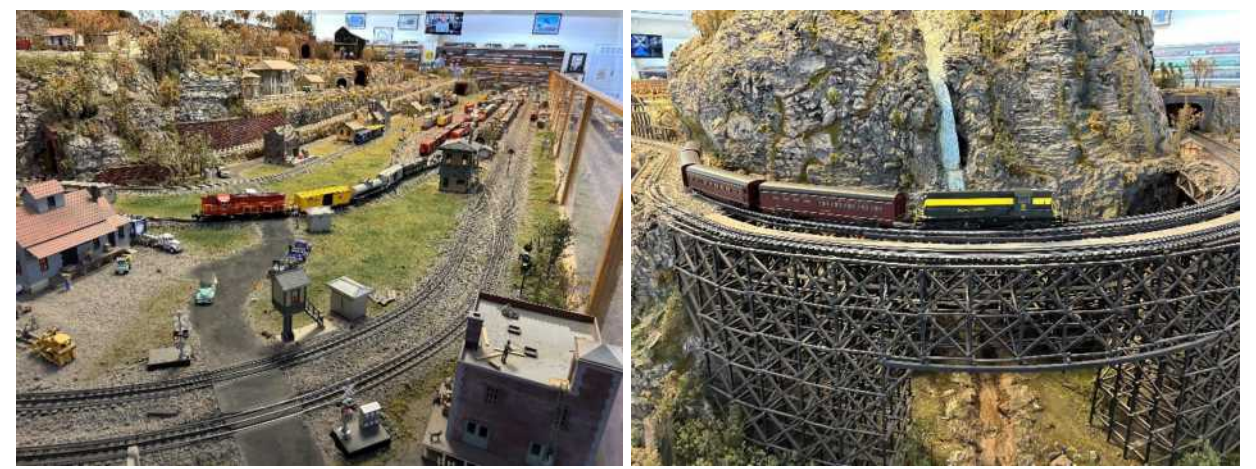
There was also a model train museum located in Bryson City, NC.