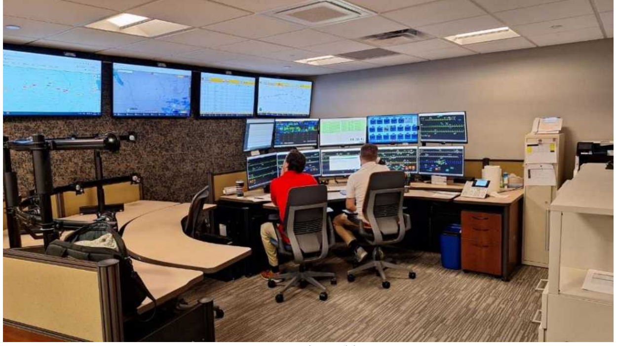
Iowa Interstate Dispatching Center

Iowa Interstate private NRHS excursion train is seen above. The location at this point was somewhere between Cedar Rapids and Silvis, Illinois.