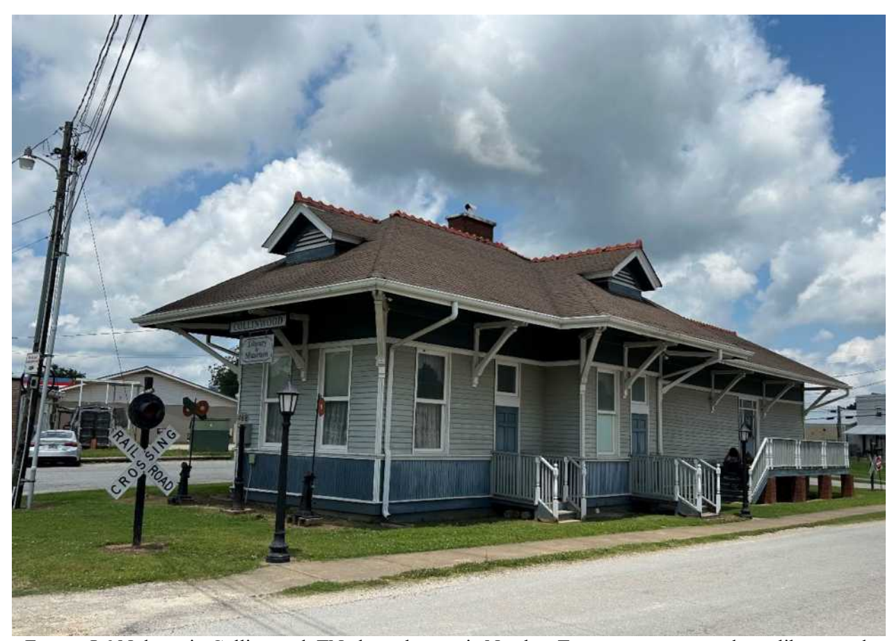
Former L&N depot in Collinwood, TN along the scenic Natchez Trace was repurposed as a library and museum.