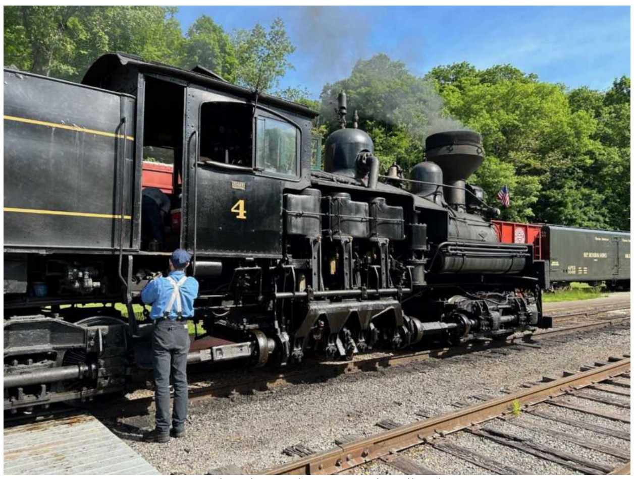
Another Shay on the Cass Scenic Railroad.