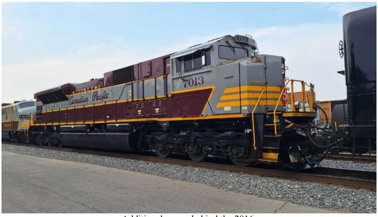
Additional power behind the 2816.