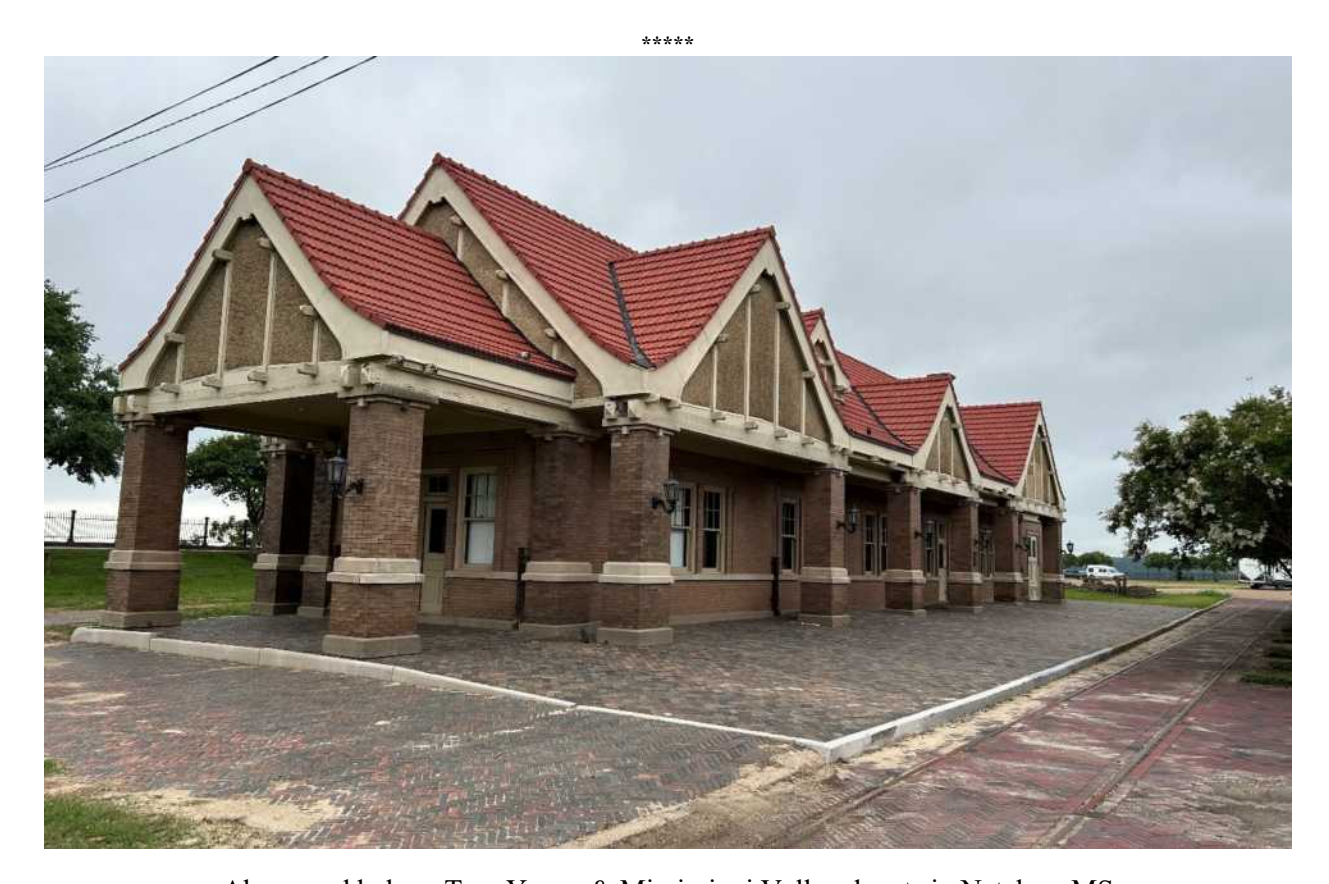
Above and below: Two Yazoo & Mississippi Valley depots in Natchez, MS