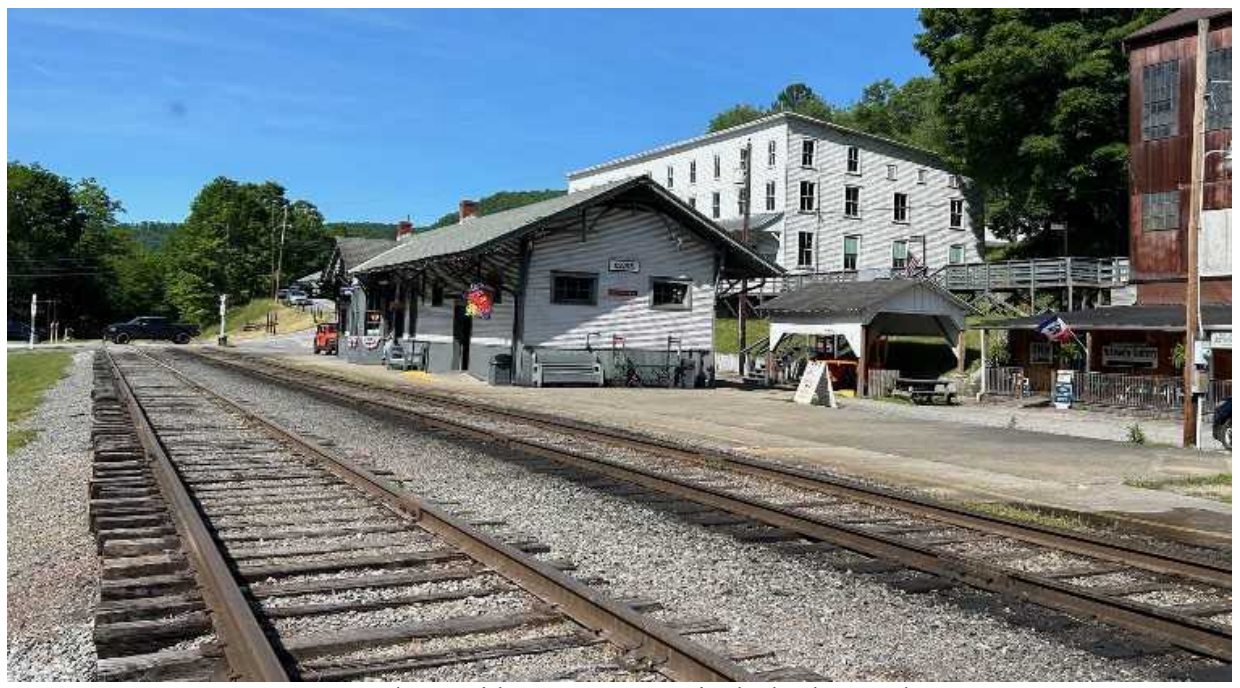
Cass depot with company store in the background.