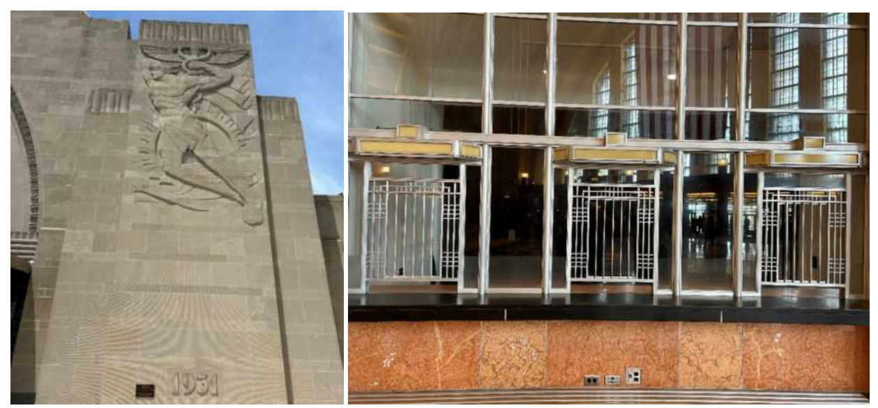
Above left: Outside feature of Union Station. Above right: Ticket Windows without ticket agents.