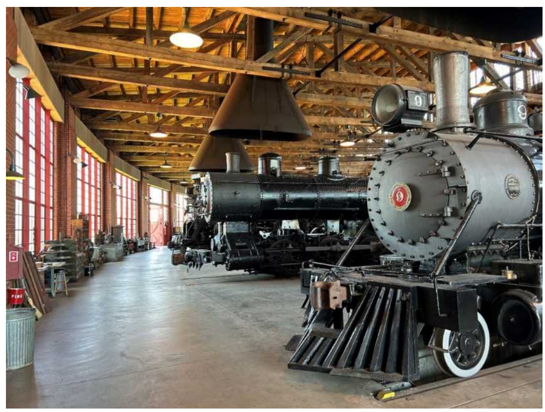
Looking the opposite way in the massive roundhouse at the Age of Steam Museum in Ohio.