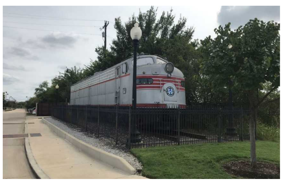
Keller, TX - Static Burlington E9 Unit (Denver Zephyr and Chicago Commuter Service) in Keller's historic downtown. The locomotive sits alone now. At one time, there was also an ATSF boxcar, BN flatcar and caboose on display. The rolling stock was removed to make room for a parking lot. What's interesting is that the line running beside the locomotive beyond the trees is the former Katy line, now UP. It was BNSF that donated the former Burlington locomotive. The North Texas Chapter was given a tour of the unit several years ago when it still had the rolling stock. Local business owners had wanted the location to be another train watching location like Saginaw, TX, but there was too much political opposition.