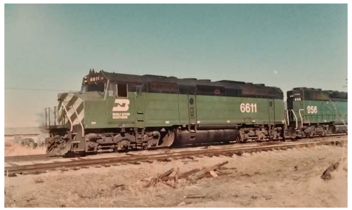
Burlington Northern Locomotive # 6611 waits at Irving on January 21, 1976.