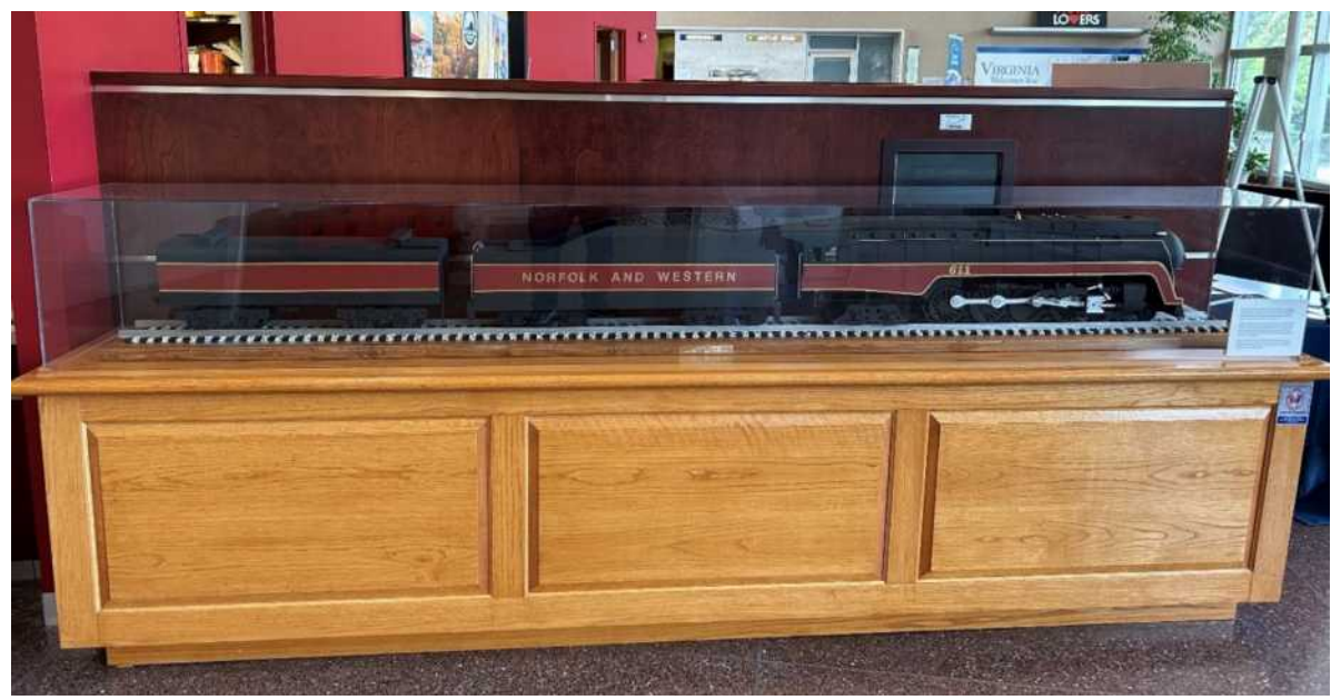
Roanoke, VA N&W depot also has a model of Norfolk and Western locomotive 611.