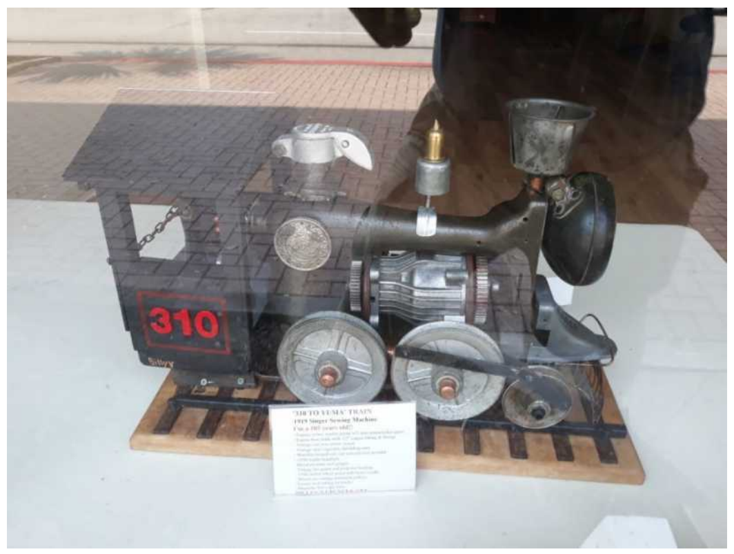
In a Galveston art gallery. Made from a 1919 Singer Sewing machine.