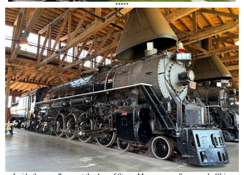
Inside the roundhouse at the Age of Steam Museum near Sugarcreek, Ohio.