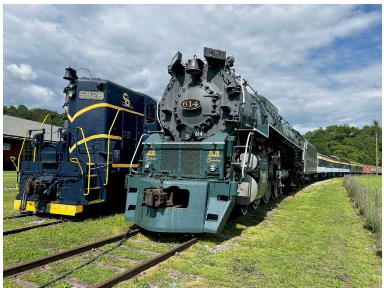
This shot is from the C&O Museum at Clifton Forge, VA. *****