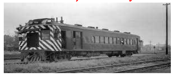
MKT doodlebug M10

Tuesday, July 2<sup>nd</sup> Chapter Meeting @ 7:30 p.m. (Meet "N" Greet at 7:00 p.m.) – Program Presentation: Video, Big Boy on Tour 2019, Part II , at the Chill Bar and Grill, Grapevine.