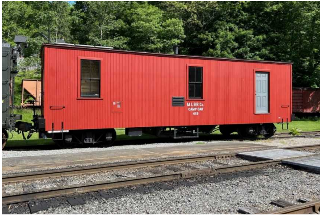
This recently restored lumber camp car will be used along with two Wabash cabooses as overnight accommodations parked along the scenic Greenbrier River.