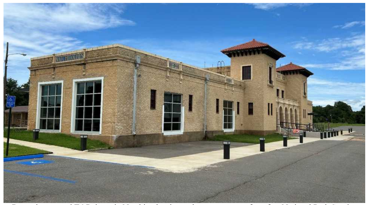
Recently restored T&P depot in Natchitoches is nearly empty except for a few National Park Service offices of the Cane River Creole National Historical Park. !