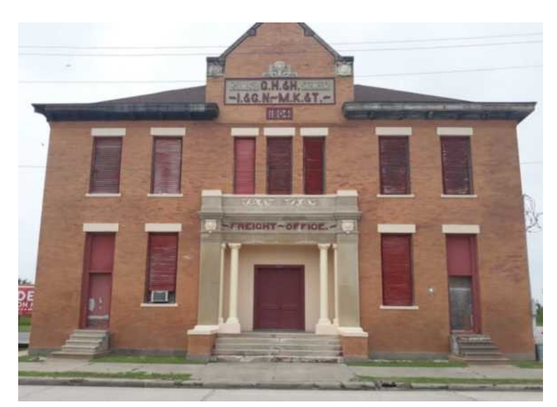
Unfortunately, the more modern Katy and MOPAC metal signs have been removed.