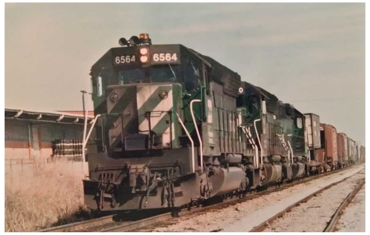
Burlington Northern Train at Irving, Texas, February 11, 1975.