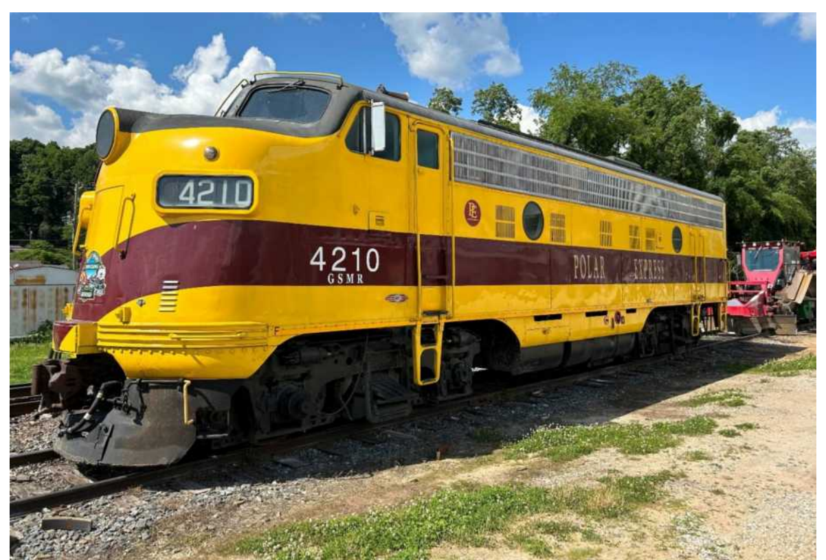
This was pulled off the turntable when our GSMR train arrived back at Bryson City. The GSMR shops were just a half mile from our motel in Dillsboro.