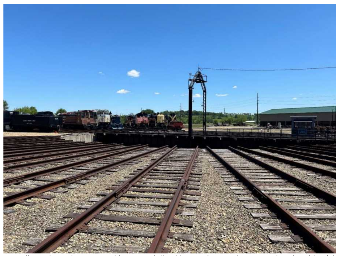
A roundhouse has to have a turntable. Several diesel locomotives can be seen on the other side of the turntable. The Age of Steam Roundhouse Museum was built in 2010 by the former owner of the Ohio Central RR. This was a dream project of his.