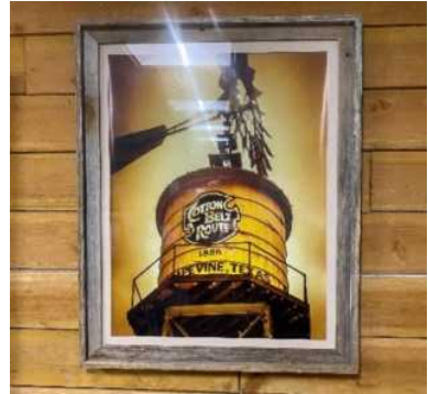
Link to Website: https://www.chillbardfw.com/

Where: Cotton Belt Room of the Chill Bar & Grill at 814 S. Main St (NW corner of S. Main St. & Dallas Rd), Grapevine, TX. Food will be available for purchase.