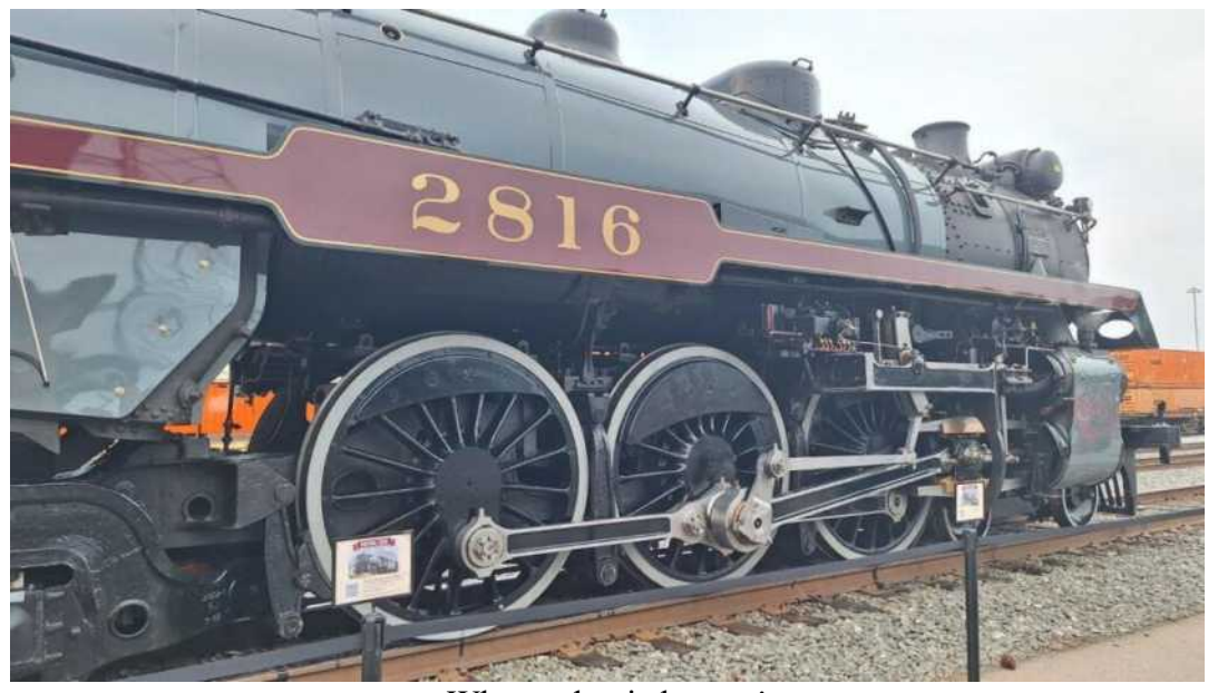
What a classic beauty!