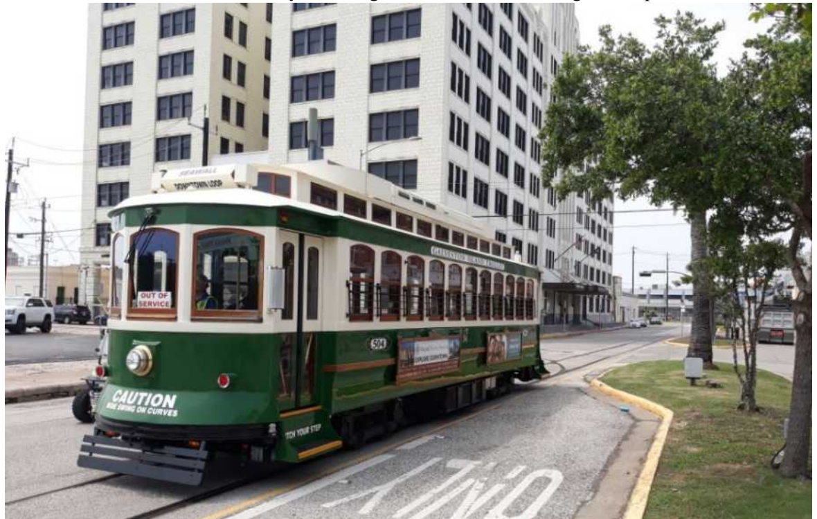
Galveston Island Trolley on 25th Street near The Strand. Santa Fe Building is in the background.

Galveston Island Trolley, Running "Out of Service". It is gasoline powered.