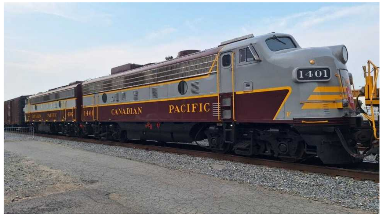
Some vintage EMD F Units were part of the power, but not as vintage as the 2816.