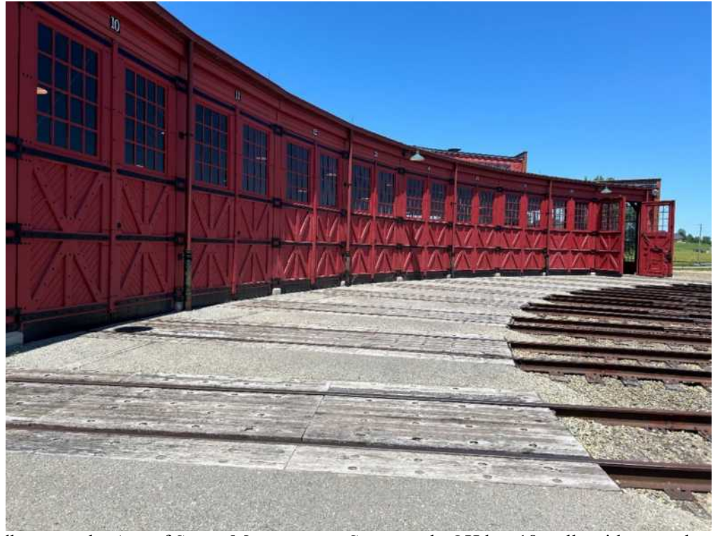
The roundhouse at the Age of Steam Museum near Sugarcreek, OH has 18 stalls with more than 20 steam locomotives and some diesels too.