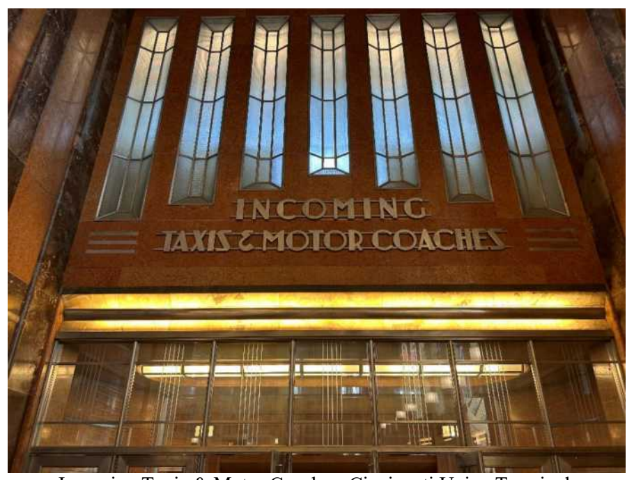
Incoming Taxis & Motor Coaches, Cincinnati Union Terminal.