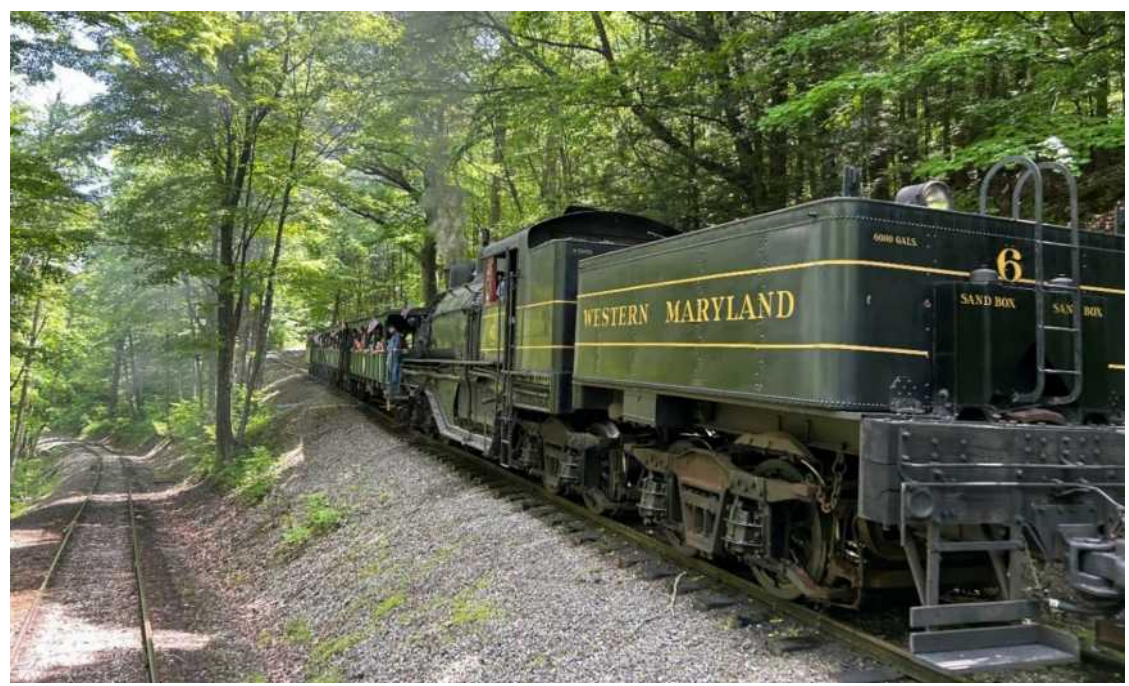
Shay #6 (the largest one made) was built for Western Maryland RR and is seen on a switchback on its way to Whittaker Station. The complete route to Bald Knob (altitude +4800 ft.) includes grades up to 13% and two switchbacks.