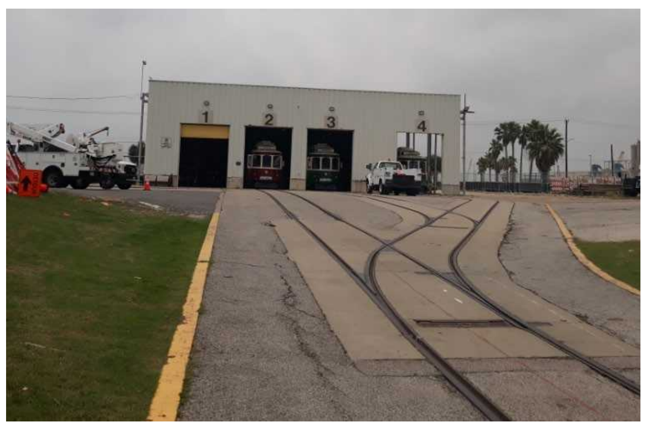
Galveston Island Trolley Car Barn. Tourists are not allowed past this point.