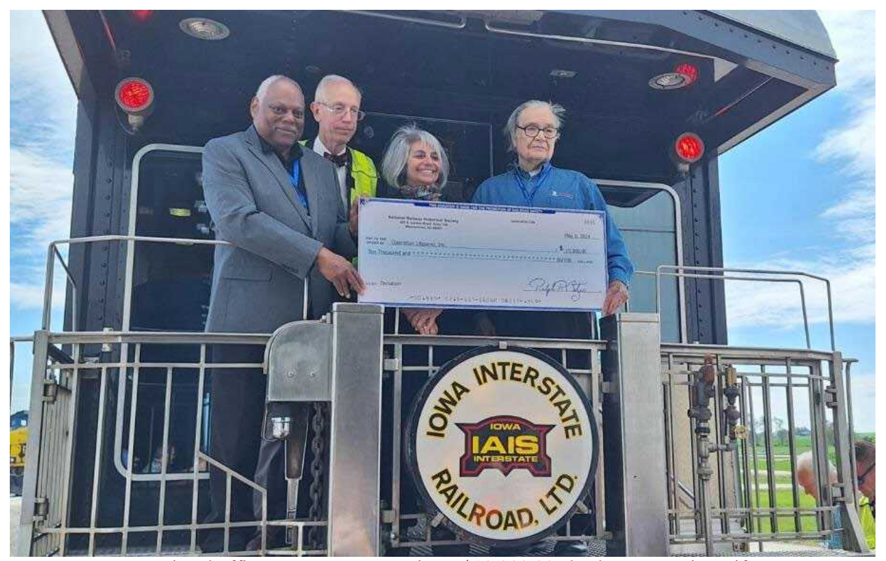
NRHS National officers are seen presenting a $10,000.00 check to Operation Lifesaver.